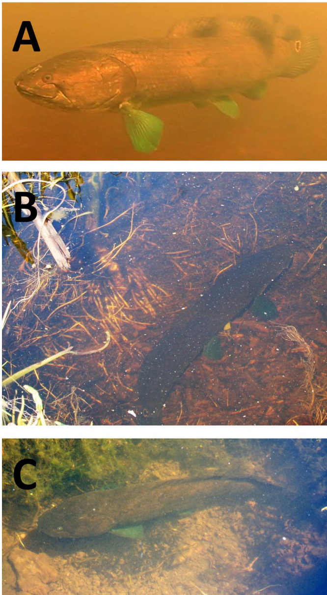
Fig. 1. Roving and guarding male bowfin in spawning coloration. (A) Male swimming in Big Bay Creek, New York. Note bright green fins and the prominent ocellus on the caudal peduncle, both characteristic of spawning coloration. (B) Male lying on constructed nest with stripped roots. (C) Male guarding fry on his nest. Black fry are seen in contrast to the brown substrate and are in a round patch underneath the male from approximately the snout to just anterior to the pelvic fins.

We found these newly hatched larvae to be very cryptic. On the nest, the male guards the eggs, and hatched fry (about 7 mm long), for about eight to ten days (Reighard, 1903). Wriggling and actively swimming fry are jet black and highly visible (Fig. 1C). After eight to ten days, the male will venture from the nest with his ball or traveling school of black fry (Fig. 2D), which, by that stage, are about 11–12 mm or larger (Reighard, 1903). Males continue to care for fry until they are as much as 100 mm long (Reighard, 1903; Forbes and Richardson, 1908).