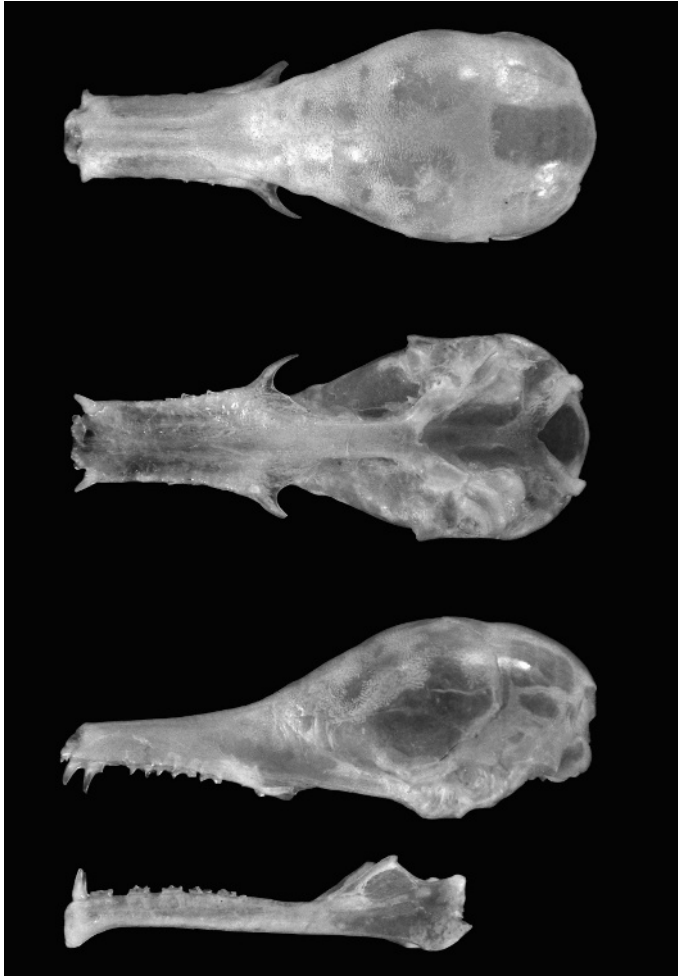
Fig. 2. —Dorsal, ventral, and lateral view of cranium and lateral view of mandible of an adult female Choeroniscus minor (ZMH [Zoologisches Museum Hamburg, Universität Hamburg] 9301), collected in 1982 by E. Patzelt from Rio Cuyabeno, Ecuador. Greatest length of skull is 22.50 mm. Photographs by H. Schliemann.

fossae are well defined, rather deep and long, and are separated from each other by a wide portion of the skull base. Mandible is long and narrow and the coronoid process is short, barely projecting beyond the articular process. The mentum has a marked symphyseal projection.