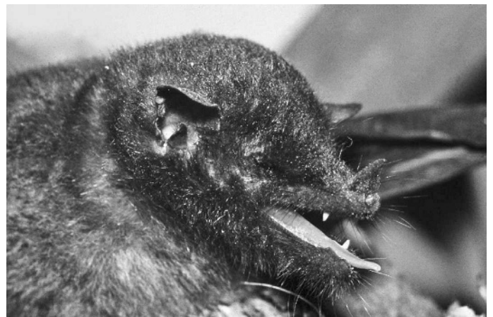
Fig. 1. —An adult female Choeroniscus minor from Rio Cuyabeno, Ecuador, collected in 1982 by E. Patzelt (Zoologisches Museum Hamburg, T 1380).

NOMENCLATURE NOTES. The genus name Choeroniscus with minor as its type species was introduced in 1928 by Oldfield Thomas for the “normal headed species” that included minor , intermedia , inca , and godmani , thus separat-