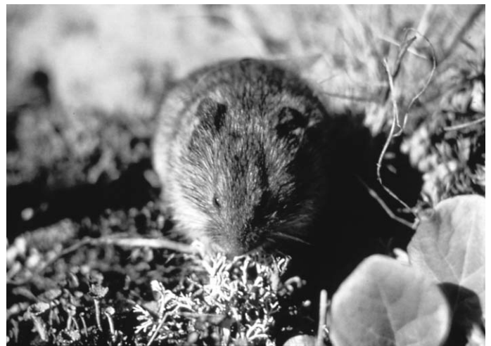
Fig. 1.—An adult Microtus miurus miurus from Alaska.