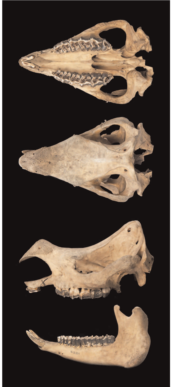
Fig. 4. —Ventral, dorsal, and lateral views of skull and lateral view of mandible of a mature male Rhinoceros sondaicus (Natural History Museum [London] specimen 1876.3.30.1) collected in the Sunderbunds, West Bengal, India, in 1876. Greatest length of skull is 523 mm.