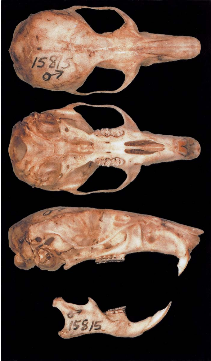
Fig. 2. —Dorsal, ventral, and lateral views of skull, and lateral view of mandible of an adult male Peromyscus fuvvus (Monte L. Bean Life Science Museum, Brigham Young University [BYU] 15815) from Rancho El Paraiso, 6 km SW Huauchinango, 2,000 m, Puebla, México. Greatest length of skull is 34.8 mm.

in very old specimens, equaling the interorbital breadth, instead of narrowing to about one-half this width, as in most species of the genus” (Allen and Chapman 1897:202). Nasals extend about 2 mm beyond the intermaxillary bones, palate has a thicker, upturned posterior margin, and palatine foramina are relatively broad (Allen and Chapman 1897).