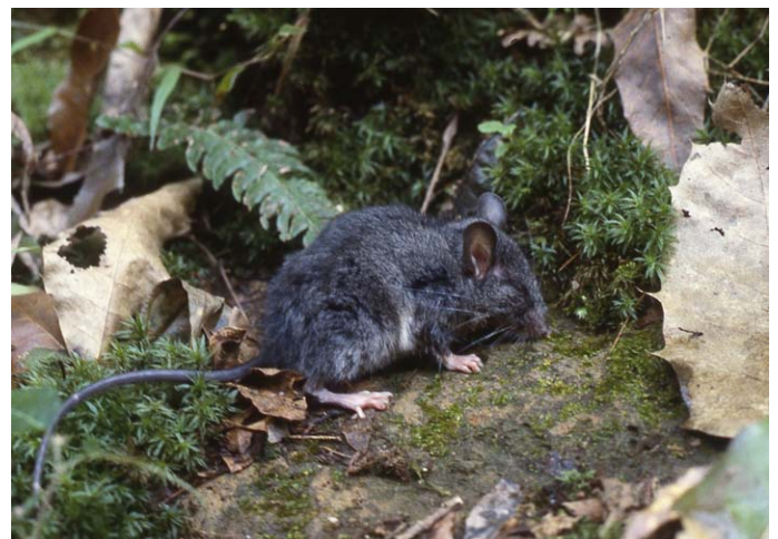
Fig. 1. —An adult female Peromyscus fuvvus from 5 km SE Jalapa, Veracruz, México.

Peromyscus fuvvus (Fig. 1) is one of the larger members of the genus Peromyscus (total length of adults rarely < 250 mm and greatest length of skull usually > 32.0 mm). Cranial features (Fig. 2) of Peromyscus are: "Skull very large in comparison with the external measurements of the animal, and very strong and heavy for a Peromyscus " (Allen and Chapman 1897:202). Skull is very similar to other members of the genus Peromyscus except for the rostrum, which is "very broad, inflated anteriorly, and distinctly bell-shaped, the breadth across the tip of nasals,