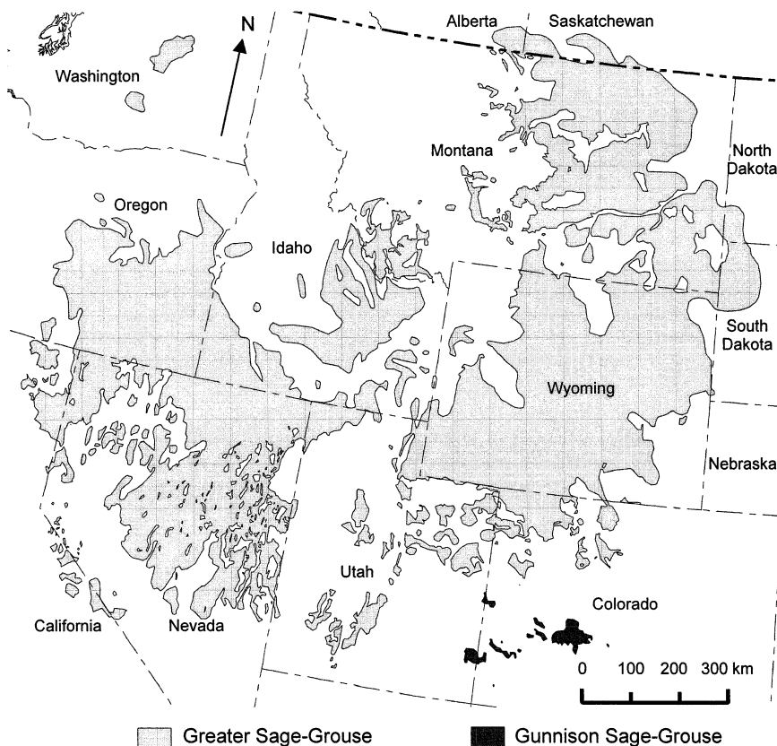
FIGURE 2. Current distribution of Greater and Gunnison Sage-Grouse in North America around the year 2000.

Arizona border (Huey 1939, Fig. 1). Phillips et al. (1964) considered the range of sage-grouse in Arizona to be hypothetical. The history of sage-grouse in southern Utah (Griner 1939, Lords 1951, Beck et al. 2003), and by extension northern Arizona, is poorly understood, due to the small number of travelers and early changes in habitat associated with settlement (Brown and Lowe 1980, Miller and Eddleman 2001). Rasmussen (1941:267) suggested that livestock grazing in northern Arizona was so severe in the 1870s and 1880s that the habitat was permanently altered: "Like most lowland sagebrush areas in the Great Basin, the associated grass species have almost all been destroyed by indiscriminate and unregulated grazing." Recent history has shown populations continuing to recede northward. For example, two recently extirpated leks in southern Utah were only 30 km north of the Arizona-Utah border (N. L. McKee, pers. comm.). In addition, sage-grouse have been ex-