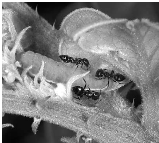
Fig. 1. Crematogaster ashmeadi ants tending a late instar Cyclargus thomasi bethunebakeri larva. Several other C. ashmeadi ants were present but not visible in this photo.

Both Forelius pruinosus and Tapinoma melanocephalum may be opportunistically imbibing food rewards from C. t. bethunebakeri larvae. Field observations suggest that their behavior offers little or no protection for the larvae they tend;