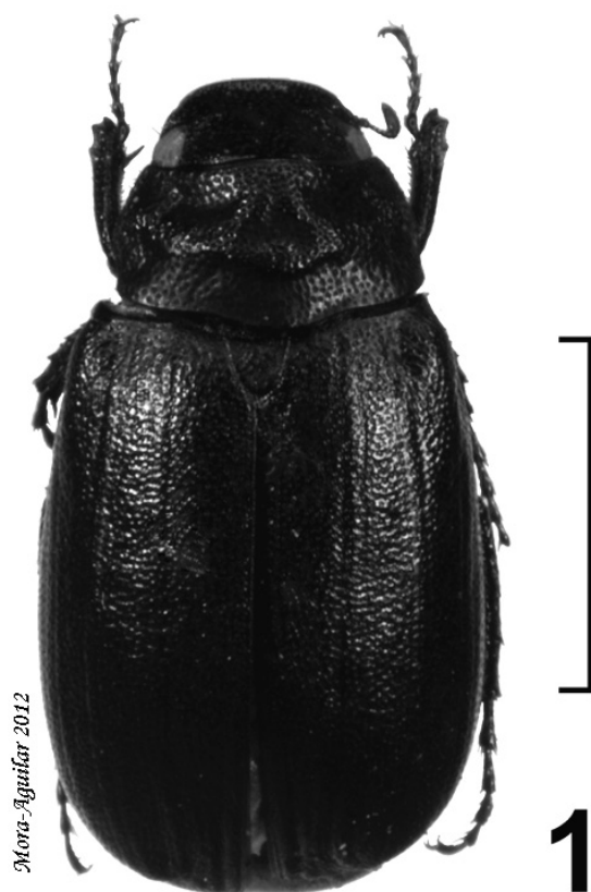
Fig. 1. Habitus of Diplotaxis multicarinata sp. nov. Delgado and Mora-Aguilar. Scale = 5 mm.

surface glabrous and venter with scarce, small setae. Clypeus rectangular, wide, apex truncate, anterior angles rounded, length 2/5 cephalic length; surface broadly concave with large, dense and umbilicate punctures; apical fourth with small, simple punctures; sides slightly indented in front of eyes; ocular canthus not prominent. Frontoclypeal suture marked at sides, obliterated at central 2/3 . Frons with triangular, central, deep impression, and 2 oblique impressions adjacent to eyes and extending to the vertex; surface with large, dense, and umbilicate punctures. Transverse eye diameter almost 1/7 as wide as head. Antennae 10-segmented, length of club equal to length of antennomeres 2-6 combined. Labrum flat, anterior margin slightly curved; at middle 2.1 times longer than and situated slightly below reflexed underside of clypeus; finely rugose. Mandibles large, bulbous. Mentum almost flat, with anterior declivity marked by a transverse, bisinuate, and setose ridge, and with a small, central tooth.