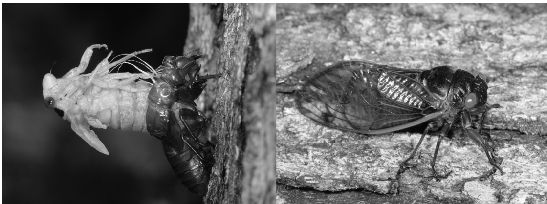
Fig. 1. Periodical cicada nymph from Brood XIX in South Carolina molting into the adult stage.

Three South Carolina state institutions established internet sites for citizens to report sightings (Clemson University: http://clemsoncicada.word-