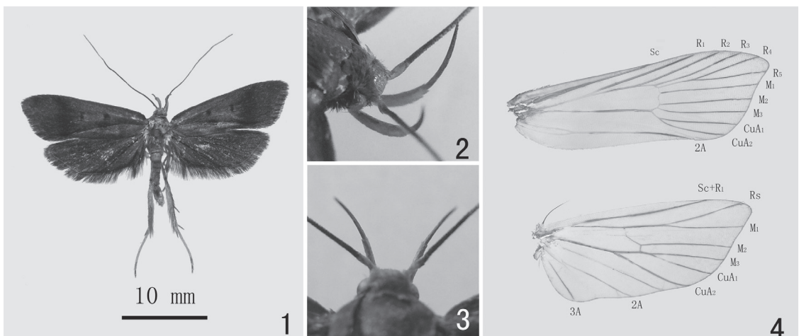
Figs. 1-4. Adult. 1. Adult of Synersaga atriptera sp. nov. ( \delta ); 2. Lateral view of head of S. atriptera sp. nov. ; 3. Dorsal view of head of S. atriptera sp. nov. ; 4. Venation of S. atriptera sp. nov.

Male genitalia (Fig. 5) Uncus listric. Gnathos rather slender, apex recurved like sharp hook.