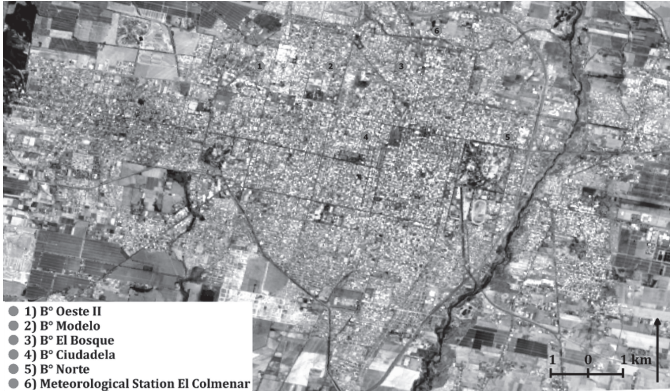
Fig. 1. Aerial photograph of the study area in San Miguel de Tucumán, northwestern Argentina.