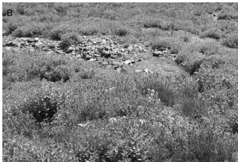
FIGURE 3. Examples of the plant associations found at opposite ends of the primary DCA axis, with characteristic (A) Arctostaphylos uva-ursi (bearberry) and (B) Tofieldia glutinosa – Carex lenticularis (false asphodel–Kellogg sedge).

Bowman and Seastedt, 2001; Löffler and Pape, 2008; or isolation and dispersal: e.g., Marchand et al., 1980; Molau and Larsson, 2000; Vittoz et al., 2009), simple geomorphic indicators account for much of the variation in composition and thus in regional diversity. To the extent to which we do capture soil conditions such as soil moisture, other geomorphic variables explain more variance. Overall, the use of geomorphic variables that are relatively easy to determine in the field proved to be a useful approach in an effort to understand how climate is modified at the plant scale.