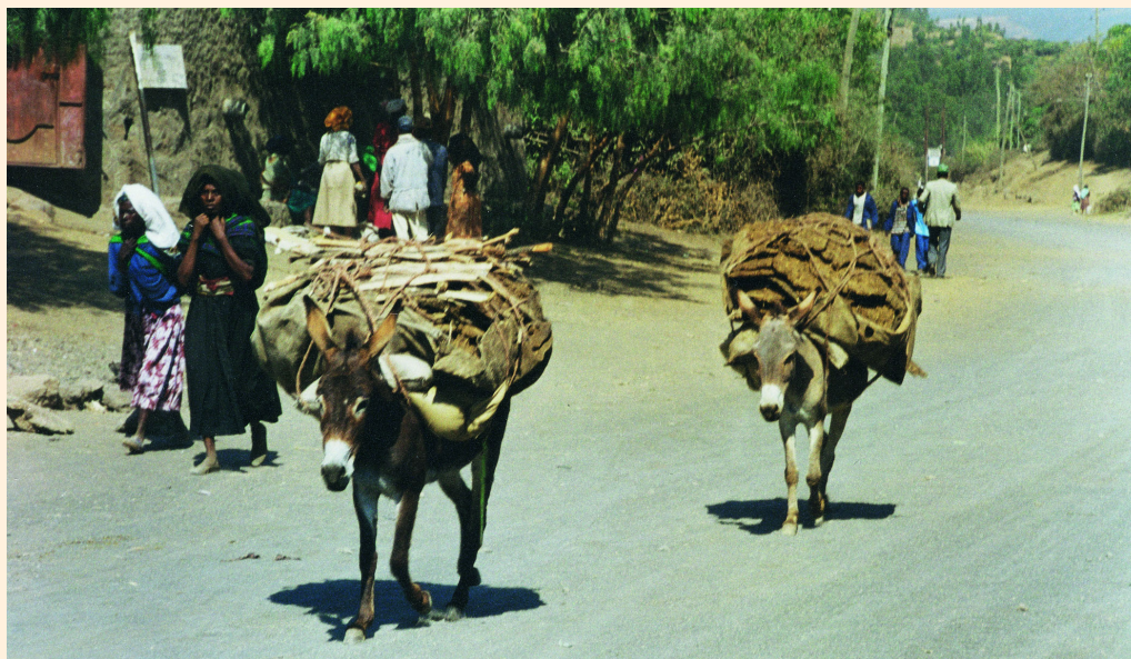
FIGURE 4 Dung is a marketable commodity and is used domestically as a substitute for firewood instead of being spread as fertilizer to compensate for soil nutrient depletion.

“We used to have community rules that governed land use and even helped to protect trees and water resources. That was before the Derg (communist regime) and democracy.” (Abraham Eidy, an Ethiopian farmer)