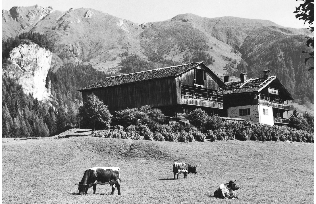
FIGURE 3 These Pinzgauer cattle are one of the few remaining purebred breeds in the Austrian Alps. After many years of decline in the numbers of this breed, Pinzgauers are now internationally sought for freerange cattle production in the Alps. Pinzgauers are good milk and beef producers. Until recently, the Austrian government paid premiums to breeders in accordance with EU regulations on endangered species.

social and economic disparities between disadvantaged and more advantaged regions need to be assessed as well. In this respect, discussions about genetic engineering become part of a general discussion about the future development of marginal regions, increasing regional product awareness, and local identity. Present policies in many Alpine regions seem to support contradictory directions in development, for example, intensification of agriculture and preservation of agricultural biodiversity (Figure 3).