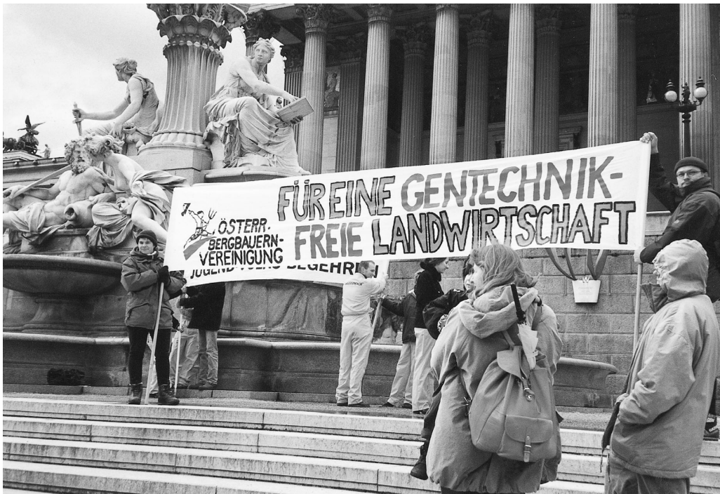
FIGURE 2 Organic farmers and concerned environmentalists from all over Austria gathered in spring 1997 to demonstrate against the use of GMOs in agriculture. This demonstration launched a petition campaign to hold a referendum on the use of GMOs in Austrian agriculture. Over 1 million citizens (ie, over 15% of the population) signed this petition.

and discusses establishment of GMO-free regions as an alternative option for technology development.