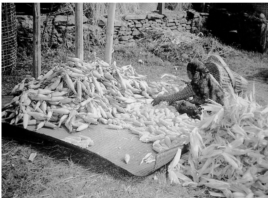
FIGURE 3 Gendered activities such as selecting seeds for consumption or the next year's planting are a vital postharvest task that ensures adequate nutrition in mountain communities.

postharvest activities that includes grain storage, food processing, and food preparation. As grains or other crops come in from the fields, women decide what will be stored, processed, and saved for next year's crops (Figure 3). In making these decisions, women concentrate on providing adequate and nutritious food for their families throughout the year. They must consider factors such as taste and the texture of the food, depending on the meals that will be prepared and whether the food will be fed to children, adults, older people, or particular animals. These decisions are based on considerations that take account of the multiple uses of crops (Sachs 1996, 1997).