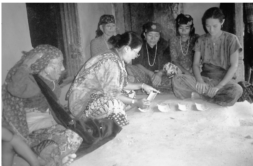
FIGURE 4 A participatory exercise in the study area.

men in Silichong. A workshop was conducted so that the team could define common research objectives, followed by training in concepts and methods of Participatory Rural Appraisal (PRA) and gender analysis. The objective of the research was to gather information on existing crops and varieties cultivated in Tamku VDC, with a particular emphasis on the role of women and men in the management of crops and other livelihood strategies. This initial research was conducted over a period of 3 months, and the results, particularly those factors that contribute to low productivity in crop yields, formed the basis for the next stage in the assessment.