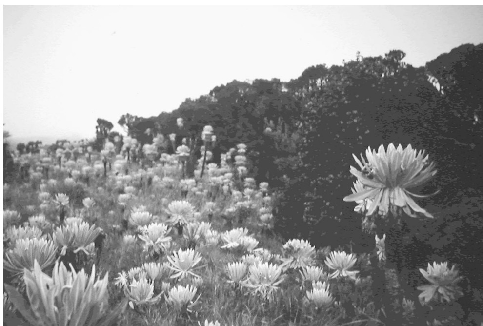
FIGURE 4 Distinctive anthropogenic boundary between the forest and the páramo in Nueva America. Note the straight line of the slope cut and the avoidance of ravines and brooks not suitable for grazing or agriculture. Often, semicircular shapes are observed as evidence of previous kilns for charcoal extraction.

The notion of anthropogenic community composition, landscape structure, and ecosystem function is a viable succinct explanation for Andean tree line dynamics, both in the upper and lower boundaries of the native TMCFs (Figure 4). The simplified, temperate-based view of altitudinal vegetation belts moving up and down