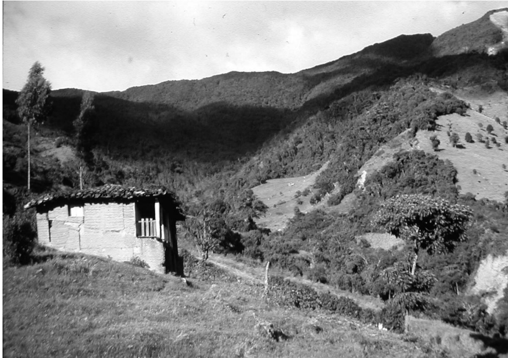
FIGURE 2 A view of the rural landscape of Carchi province, where human activity encroaches on the TMCs and expands the agricultural frontier, thus raising the lower limit of the tree line. Past activity has been more important in forming the páramo and the upper tree line. Past and current pressures make protection of cloud forest remnants crucial in this area.

forests still survive in isolation above 3800 m (Sarmiento 1988) around Chique Lake. The climate pattern, typical of the tropics, is characterized by generally uniform temperatures the year round (mean temperature 12°C) and 2 distinctive moisture regimes—a rainy season with mean precipitation of 2700 mm/year and a dry season with mean precipitation of 520 mm/year (Cañadas-Cruz 1983). Isolated “islands” of páramo display typical grass-