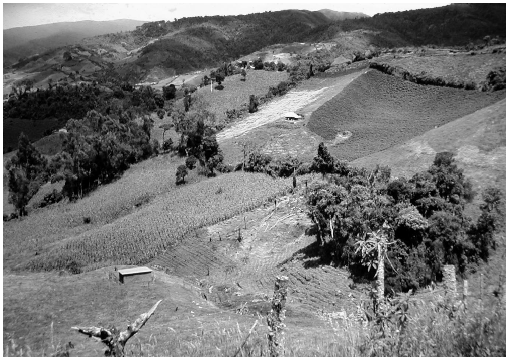
FIGURE 3 A panoramic view of the rural landscape showing the heterogeneity of land uses and the prominence of potato and corn cultivation. Note native trees surviving along the hedgerows, steep brooks, and other areas unsuitable for agriculture or grazing.

The expanding population and opening of new agricultural lands do not appear to have greatly affected the páramo border in the eastern range within the study site. A continuous 50-km stretch of intact forest