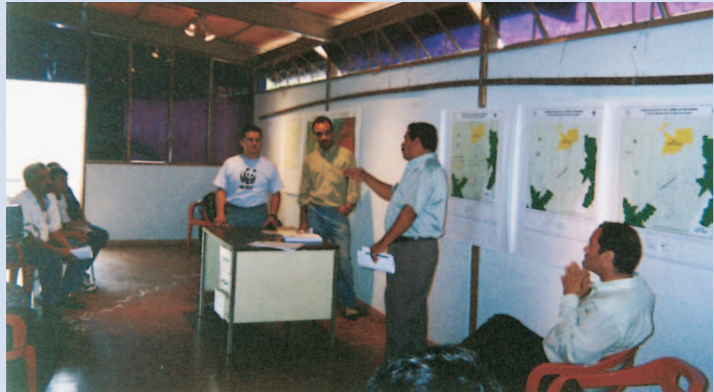
FIGURE 4 Leaders of farmers' associations participating in a workshop to discuss options for maintaining a forest corridor to ensure water supply.