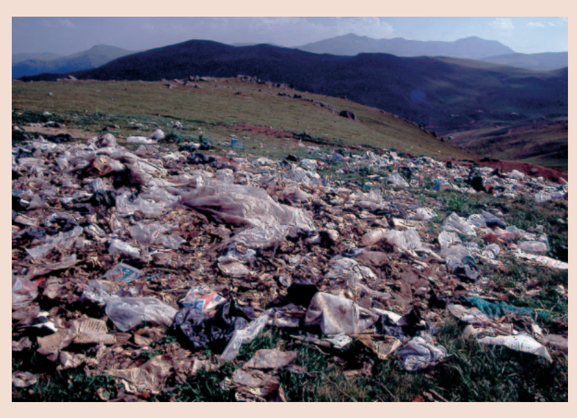
FIGURE 4 Litter remaining after the festival: a heavy burden on the environment.

demand for local tourism activities, highland festivals began to attract intense interest. Highland festivals, held by a limited number of local people who walk from their villages to perform traditional dances, now attract tens of thousands of people who travel for great distances, from different cities and countries. As a result, thousands of vehicles pile into the festival spaces (Figure 3). Damage done by people and vehicles surpassing the local carrying capacity in a single day is immense. Overcrowding, noise, exhaust emissions, littering (Figure 4), provisional tents and prefabricated huts set up for a day exert too much pressure on the ground, damage the local flora, and disturb local wildlife.