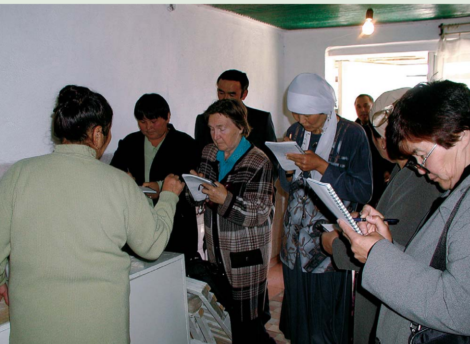
FIGURE 3 Exchange of experience between villages is the main idea of AGOCA: CAMP training in Swiss cheese-making technology for women in Akshi, Kazakhstan.

As pointed out in the report of the first Conference of Mountain Communities, “The differences between these three Central Asian countries in terms of legislative framework, autonomy from local and central government, and traditions mean that their mountain communities have an accumulation of various experiences” (see www.camp.kg/eng/index.html ). Political scientists have demonstrated that, since the collapse of the Soviet Union, the new Central Asian States have developed nationalistic discourses with strong ethnic references. This represents an impediment to cooperation in the region. Local communities sharing experience beyond their borders are thus a great counterweight to this major trend. CAMP initiated the creation of 3 follow-up agencies in Kyrgyzstan, Kazakhstan, and Tajikistan, which among other activities, provide secretariat services to the Alliance and support concrete project activities in AGOCA villages.