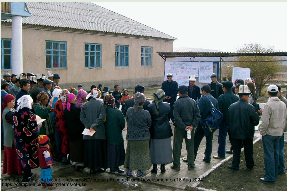
FIGURE 2 The main instrument and potential of TPSs (normally represented by a limited number of active people) is their ability to mobilize the majority of the village population when the need to discuss and solve different problems arises. Jergetal village, Kyrgyzstan.