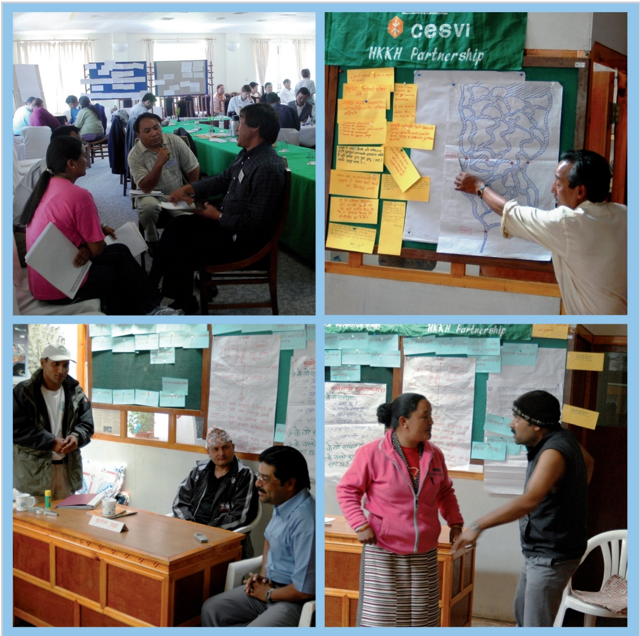
FIGURE 3 Clockwise from top left: (1) Scenario group work with tourism industry and NGO experts during the first workshop; (2) we presented the growing uncertainty of future park states and trajectories as sequential points along a braided river channel; (3) during our second scenario workshop, an actor plays a rogue community member as a metaphor for loss of local social norms; (4) in another dramatized scenario, an outside businessman tries to influence local park officials.

strongly supported park management devolution and local self-governance. However, discussion of the “autonomous Khumbu” scenario surprisingly revealed that participants did not have full confidence in local