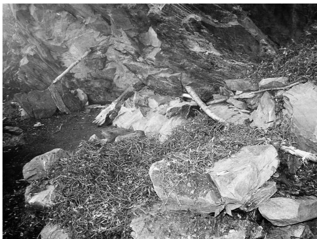
FIGURE 2 Collectors' camp under rocks: note the living space and sun drying of kutki on rocks.

Of the 85 collectors interviewed, 95.29% ( n = 81 ) were dedicated and 4.71% ( n = 4 ) were opportunistic. Dedicated collectors are those who camp and collect medicinal plants for a longer duration (up to 3 weeks) in very remote areas and focus on collection of a single species, while opportunistic collectors combine this with other activities such as livestock grazing and fuelwood collection (Olsen 1998) and may include collection of multiple species. Women were generally opportunistic collectors in the study area. The collectors reported many serious injuries, including the death of 1 person in 2009 during Picrorhiza collection on steep slopes.