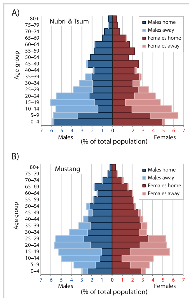
FIGURE 2 Age–sex composition of populations by residence, 2012 in (A) Nubri/Tsum and (B) Mustang.