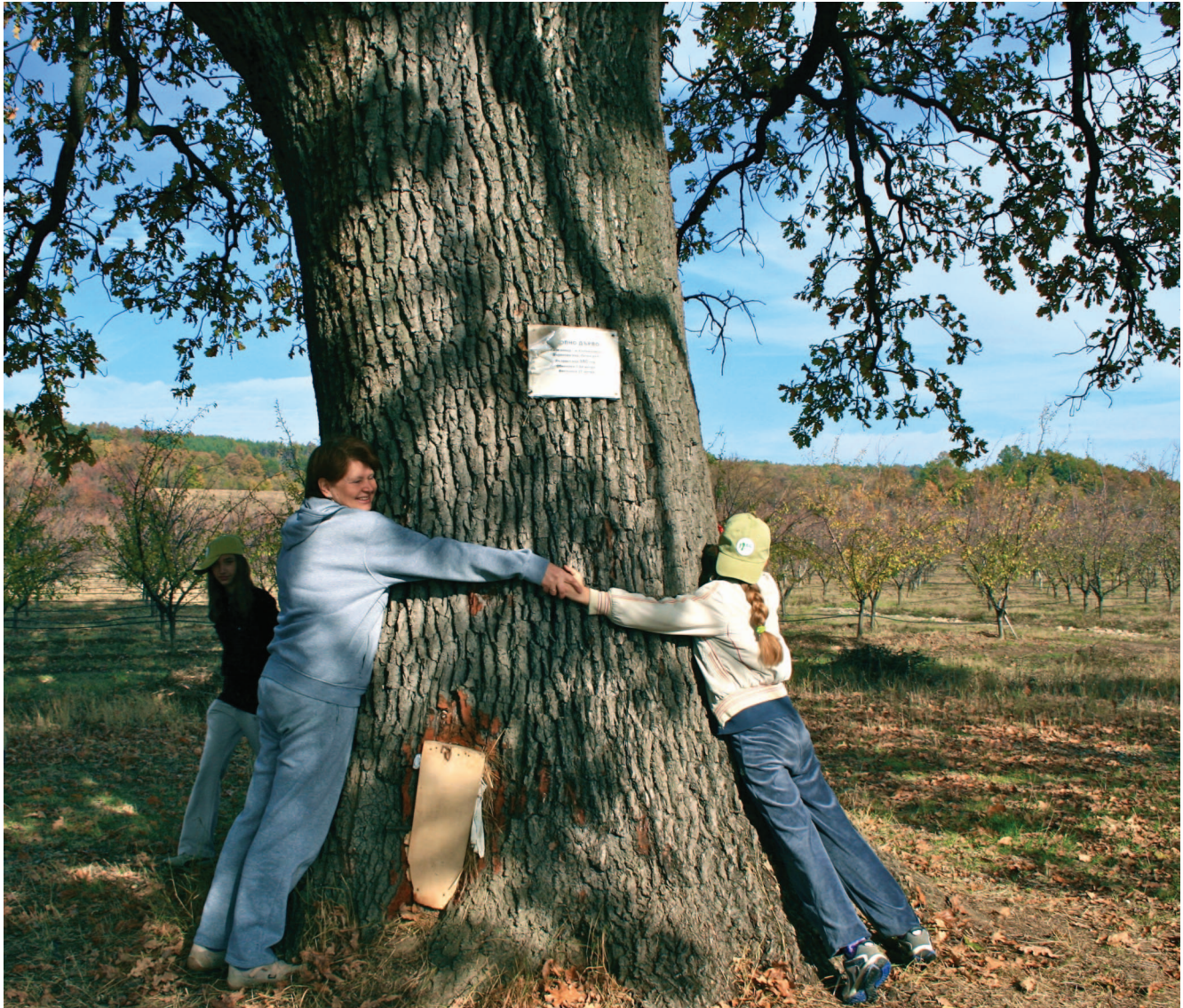
FIGURE 2 Big Foot participants discovering their local natural and cultural heritage near Berkovitsa, Bulgaria.

work affects protected areas, thus helping to decrease conflicts between conservation and land use. For example, training farmers could help prevent harmful grazing practices or the disappearance of traditional livestock breeds. IP can support this process. An example is the Farmers Education project in Greece, which used IP to train farmers to adopt new approaches to production and product promotion (document 4).