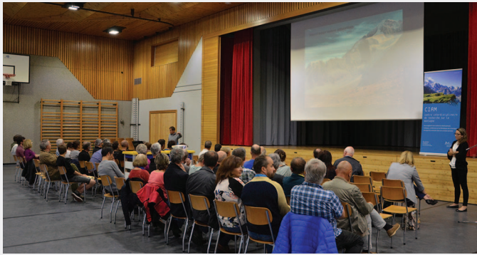
FIGURE 2 Conference on permafrost-related risks in mountains organized by CIRM in the village of Evolène, 13 June 2019.

transdisciplinary dialogue (see Otero et al, submitted, for an in-depth evaluation).