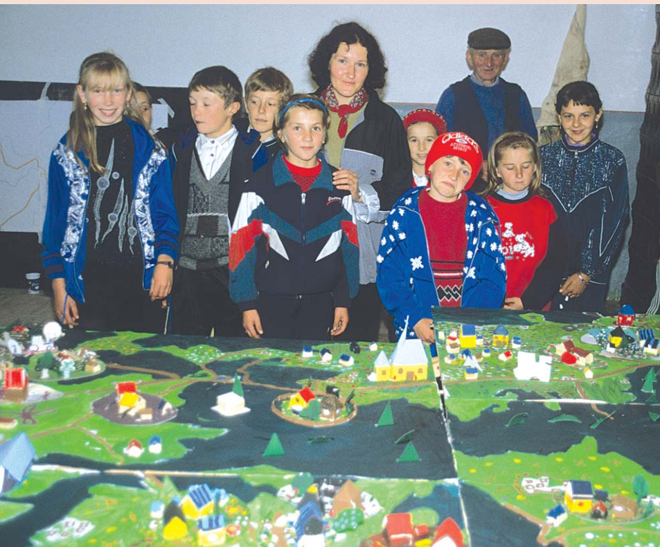
FIGURE 3 “Planning for real:” Gheţari pupils display their 3-dimensional vision of their village in the future. This model served as a tool for further discussion with their parents and other stakeholders.

financial instruments, and better marketing strategies are implemented. Successful regional development will be the most convincing argument in the transfer of results to other rural mountain regions of Eastern Europe.