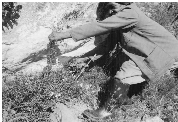
FIGURE 2 Harvesting of buchu .

majority of people questioned (87%) admitted that they had heard about concerns regarding the threat to wild buchu , including its imminent extinction. The respondents acknowledged that buchu harvesting in their area was indeed threatened, with 80% indicating that they noticed a decline in the amount available in the previous 5 years or so. However, contrary to prevailing wisdom among scientists and conservationists, according to which unsustainable harvesting practices are the major threat (Coetzee 1999; Hoegler 2000; CapeNature 2004), mountain fires topped the local list of threats, with 42% of the respondents agreeing (Table 1). This was followed by theft and unsustainable harvesting at 31 and 27%, respectively. Buchu poaching was observed to be less of a threat within Elandsbloof. However, people admitted that there was occasional stealing, as well as a problem with people from outside using their local connections to come to the farm to harvest. According to local people, the scale of theft, however, is not of any major concern with regard to the sustainability of buchu . Regarding unsustainable harvesting as a threat, respondents argued that the frequency, amount harvested, and methods used for harvesting are important but of limited concern to them. However, almost all the respon-