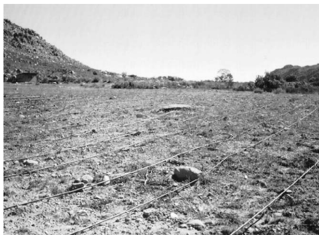
FIGURE 3 Cultivated buchu in Elandskloof.

local distilling company, the government agency Agricultural Research Council (ARC), and an overseas donor. The community of Elandskloof is only one of several pilot projects for this initiative in the area. The pilot project in Elandskloof began in 2004, with 8 households whose selection was based, among other things, on the suitability of their land for buchu growing and the availability of skilled labor. This selection of only 8 pilot households from a total of 85 has caused numerous local conflicts, as well as conflicts between locals and outside partners in the project. The fact that most of the pilot households are either members of the executive of the CPA or relatives of members, or regarded as an elite by other villagers, further fuels discontent among the rest of the community of Elandskloof.