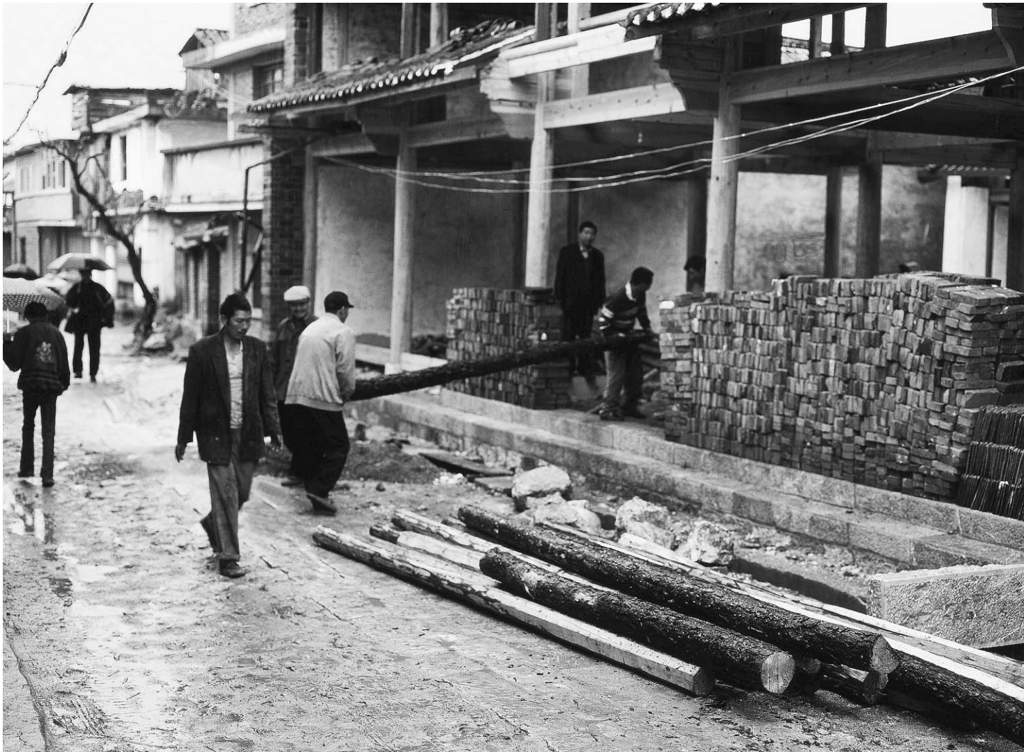
FIGURE 5 House building using the traditional fashion in Lijiang Old Town, 2002.

eastern China, not the smaller urban areas of northwestern Yunnan, like Lijiang. This growing local demand translated into a doubling and tripling of the price that Wen Hai's peasants could get for their wood.