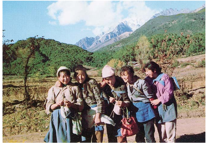
FIGURE 2 Taken during the 1993 visit by Jack Ives, this picture shows that upper Wen Hai village’s forests were largely intact despite the logging in lower Wen Hai.

My own observations in Wen Hai administrative village and Long Pan Township over the course of 2000–2002 showed that, even under the logging ban, timber cutting continued. The forests in upper Wen Hai village were now being cut (see Figures 2 and 3), and timber still flowed from the forests of Long Pan Township (see Figure 4). Follow-up observations in 2006 confirmed that illegal logging has continued until today. The present study attempts to understand peasants’ contemporary motivations for illegal tree cutting. By critically listening to peasants’ explanations for why they cut trees, it produces a narrative which posits that contemporary deforestation in Wen Hai can be better understood as a response to larger economic and social transformations in China.