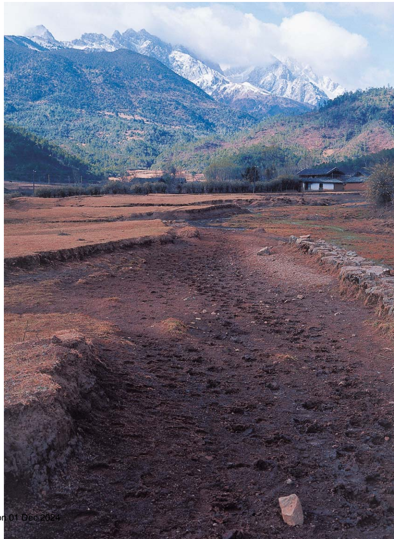
FIGURE 3 Taken in 2001, this picture shows how upper Wen Hai’s forests have been severely clear-cut since Ives’ field visit in 1993.