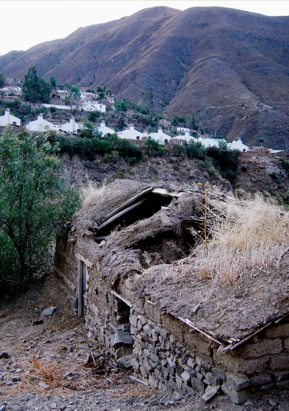
FIGURE 1 Housing trends reflecting population urbanization in local townships. Santa Victoria, northern Argentina.

cheaper than in rural areas, where people live at much lower densities in poorly accessible areas, as is often the case in mountains.