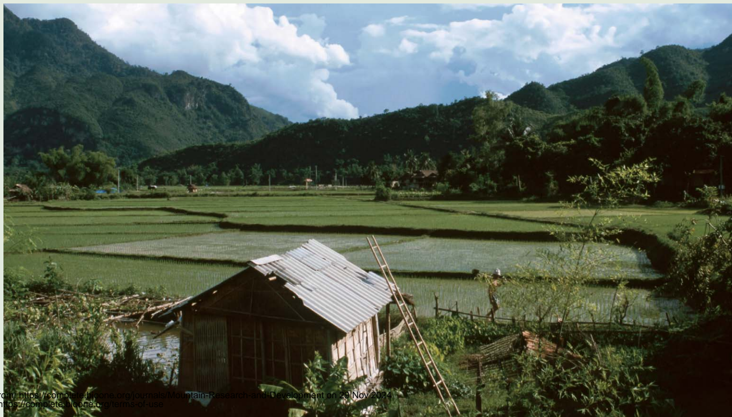
FIGURE 1 Forest resources are an important part of rural people's livelihoods: natural forests in the Pu Luong limestone range, northern Viet Nam.

Preserving valuable multifunctional forest ecosystems is a primary concern of the Vietnamese government. The perception that this can only be achieved through decentralized multi-stakeholder forest management that involves the local population in the management of resources (and not in a top-down manner) prevails among decision-makers.