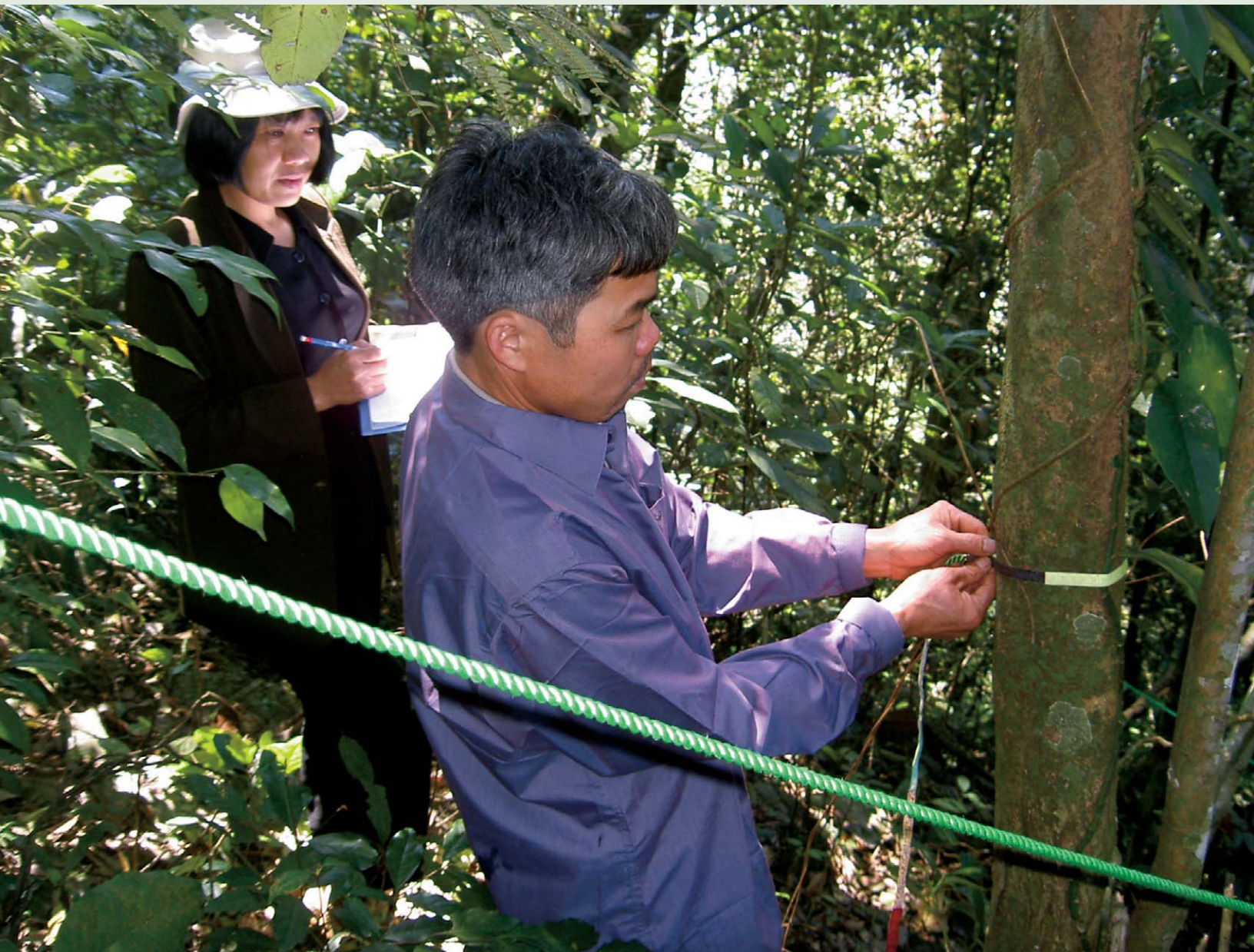
FIGURE 4 Collaboration as a key element: a villager and district forestry staff member carry out a joint forest resource assessment as a basis for defining sustainable forest management options.