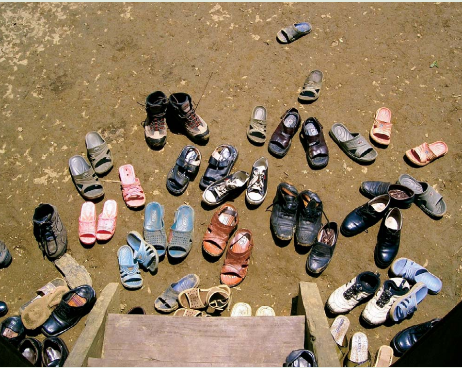
FIGURE 2 Participation as a key element: these shoes testify to the diversity of participants in a village meeting on benefit-sharing.

and extension approaches are tested in selected partner provinces across the country. Experience gained in pilot implementation is fed into the national policy dialogue, ensuring that local initiatives are backed up by appropriate long-term policies.