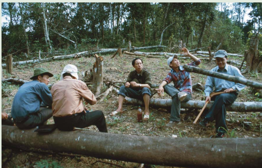
FIGURE 5 Fieldwork is an integral part of the training modules for hands-on experience, using methods learned in the field.

substantial reduction of rural poverty in highland areas will make it possible to ensure the long-term protection of Vietnamese mountain forests and to safeguard their multiple functions, which provide services and benefits that range far beyond the local level.