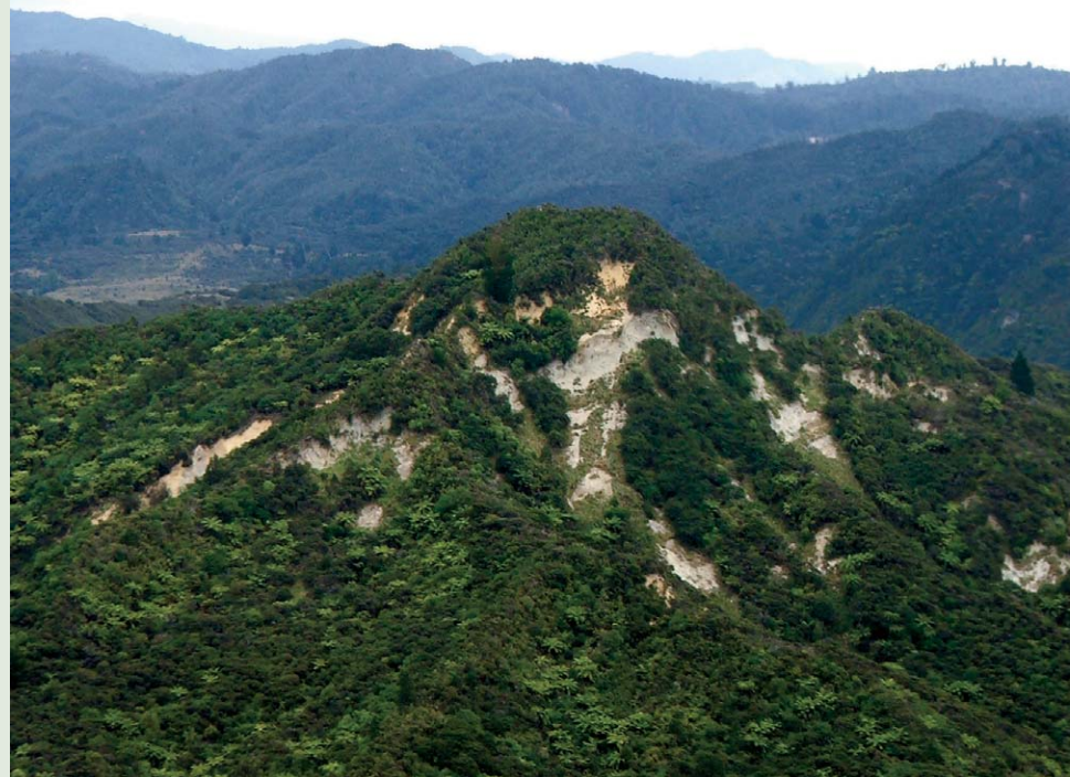
FIGURE 2 Hill-country erosion is a serious problem in the East Cape region, but reforestation can improve soil stability.

Māori landowners. At the outset, part of the project funding was allocated to purchase credits from the farmers for the first Kyoto commitment period at a uniform price of NZ$15 (US$ 11.25) per ton of CO 2 e.