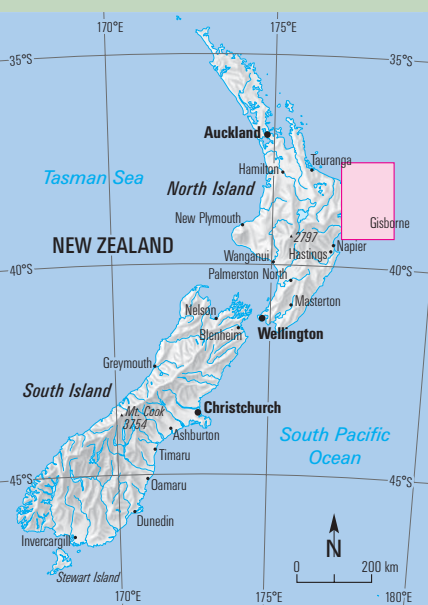
FIGURE 1 Map of the East Cape of NZ. (Map by Andreas Brodbeck)

worked with indigenous Māori landowners in a rural area of NZ to implement a “carbon farming” project—a management system that encourages reforestation and generates marketable offsets for greenhouse gas emissions under the Kyoto Protocol. Our experience in establishing a carbon sequestration project sheds light on the factors affecting uptake and project success for other groups seeking to utilize these markets as a tool for sustainable development.