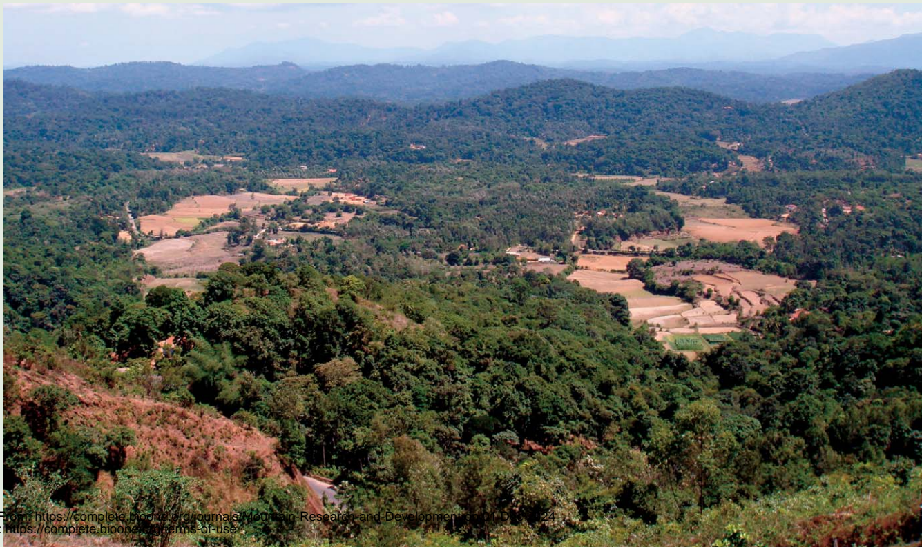
FIGURE 2 Landscape mosaic in Kodagu district: paddy fields occupy the lowlands while coffee plantations and forest fragments are located on the hilltops. A belt of forest reserves and protected areas surrounds the district, as seen on the horizon.

Forest represents almost 50% of the district. Central Kodagu is dominated by agricultural land, essentially coffee estates that cover 30% of the total area of the district. Coffee in Kodagu is grown under tree shade. The other crops associated