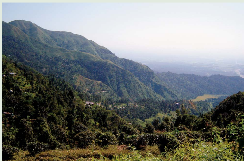
FIGURE 3 Kangchenjunga forested landscape in the Sanchel–Mahananda corridor in India.

“It is imperative that the conservation and development strategy that you are going to address has a strong bearing on transboundary cooperation, which will be a reality in the near future.” (Mr Chandi Prasad Shrestha, Former Secretary, Ministry of Forests and Soil Conservation, Government of Nepal)