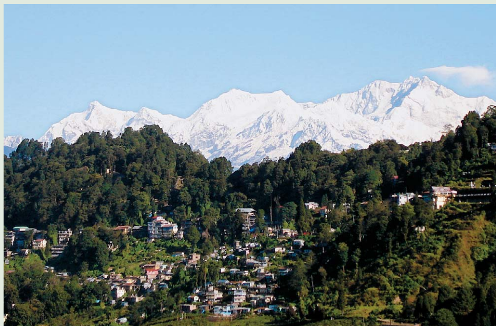
FIGURE 1 Kangchenjunga mountain range and settlements in the forested landscape, as viewed from Darjeeling, India.

The major challenge to the people living in the region is to use these ever-dwindling resources in a sustainable manner. People are an integral part of the landscape, as they derive various ecosystem services such as provisioning (eg food, fodder); cultural (aesthetic, religious); supporting (soil formation and water cycle); and regulatory (erosion, climate) services. Recent transboundary research