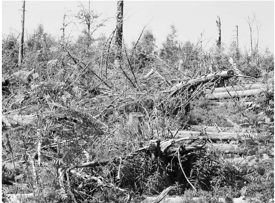
FIGURE 1 Dynamics of natural reforestation along the “Lothar” trail in the Black Forest, Germany: within a few years of the devastating 1999 storm, young trees could be seen thriving between the dead wood left lying on the ground.

Because a storm-devastated forest area can only be observed safely from a distance, an adventure trail had to be constructed to make the area accessible to the general public. This trail now provides thrilling insight in the form of a fixed rope route, leading over and under fallen trees. By contrast with the still very