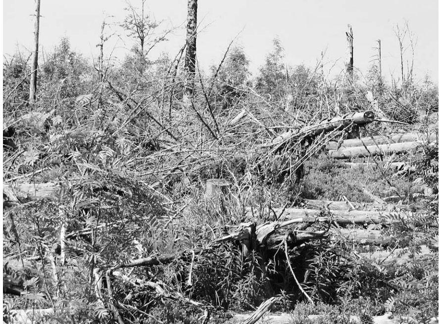
FIGURE 1 Dynamics of natural reforestation along the “Lothar” trail in the Black Forest, Germany: within a few years of the devastating 1999 storm, young trees could be seen thriving between the dead wood left lying on the ground.

Because a storm-devastated forest area can only be observed safely from a distance, an adventure trail had to be constructed to make the area accessible to the general public. This trail now provides thrilling insight in the form of a fixed rope route, leading over and under fallen trees. By contrast with the still very