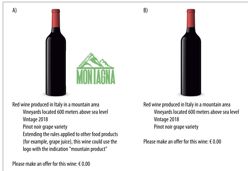
FIGURE 1 Conditions of the experiment. (A) Treatment condition; (B) control condition.

(BDM) auction (Becker et al 1964) with a sample of 273 participants from Italy (after cleaning). The online auction provider conducted quota sampling, aligned with the age distribution of the Italian population. The pretest and the auction took place in January and February 2020.