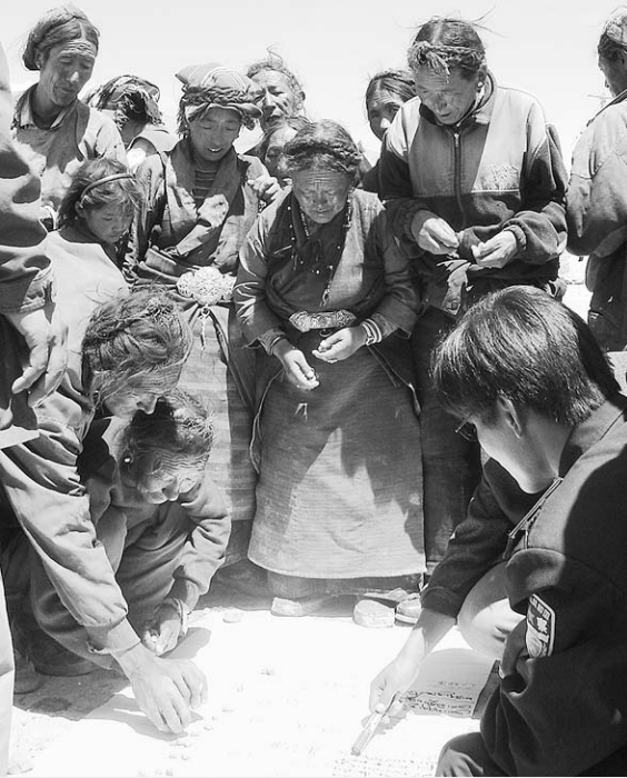
FIGURE 2 Promoting equitable co-management of rangeland resources through RRP initiatives.

rangeland for multiple purposes, but focusing on a commonly agreed goal. The core of the co-management approach is negotiation and the essence is ‘learning by doing.’ Co-management of rangeland is taking place at all RRP pilot sites at various administrative levels. The RRP is also facilitating institutional arrangements in all its pilot project countries by applying a co-management approach, using both formal and informal mechanisms.