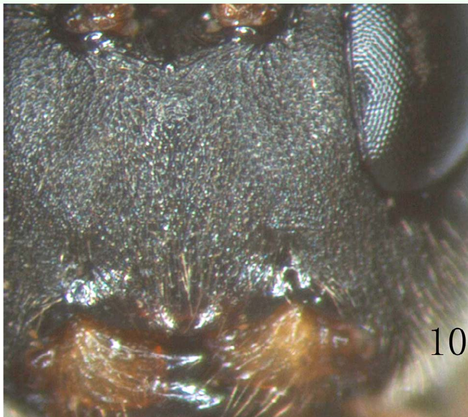
Figure 10: Rhimphoctona (Xylophylax) lucida (Clément, 1924). Face. High quality figures are available online.

Type material. Holotype♀, CHINA: Baotianman Natural Preserve, Henan Province, 1280m, 2006.V.25., Xiao-Chen Shen. Paratype: 1♂, same data as holotype. All types are deposited in Insect Museum, General Station of Forest Pest Management (GSFPM), State Forestry Administration, Shenyang, P. R. China.