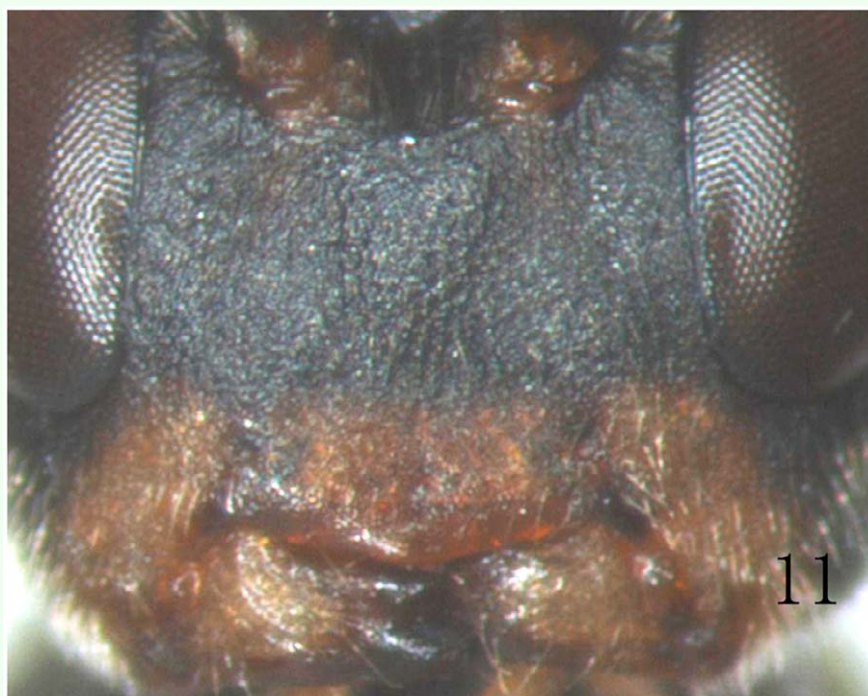
Figure 11: Rhimphoctona (Xylophylax) rufocoxalis (Clément, 1924). Face. High quality figures are available online.