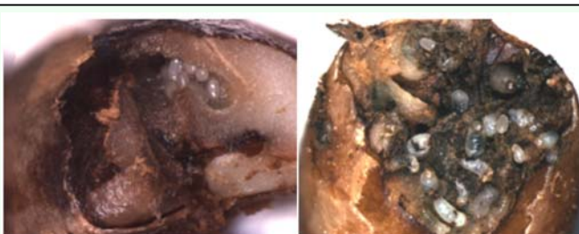
Figure 2. Hypothenemus hampei galleries containing eggs (left), and eggs and larvae (right). High quality figures are available online.