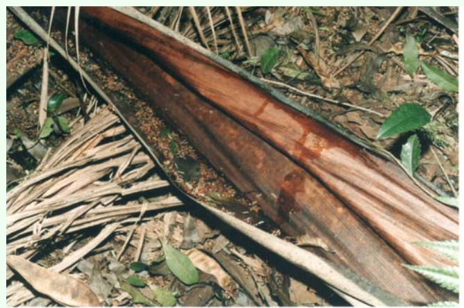
Figure 8. Fallen floral bracts of the palmetto Euterpe edulis Martius (Arecaceae) at the field site in Iguazú National Park, Misiones Province. High quality figures are available online.