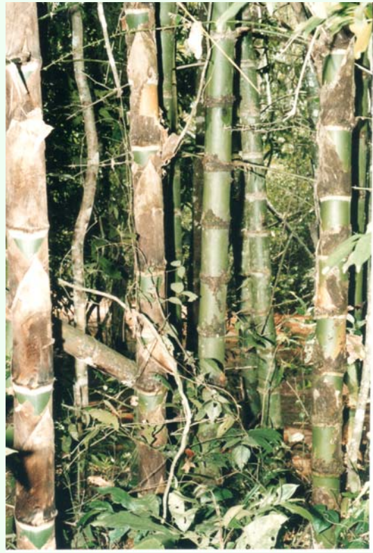
Figure 4. Guadua chacoensis (Rojas) Londoño and Peterson (Poaceae) at the forest site in Iguazú National Park, Misiones Province. High quality figures are available online.