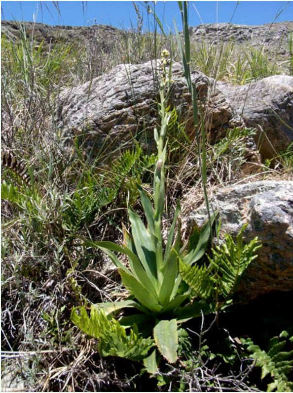
Figure 3. Eryngium aff. serra Cham. and Schltldl. (Apiaceae) at the field site in Sierra de la Ventana, Buenos Aires Province. High quality figures are available online.