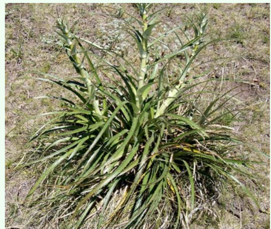
Figure 2. Eryngium horridum Malme (Apiaceae) at the field site in Sierra de la Ventana, Buenos Aires Province. High quality figures are available online.