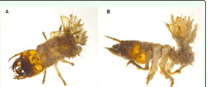
Figure 10. Habitus of larva of Pachyteles sp. (Carabidae), A: dorsal ; B: lateral. High quality figures are available online.