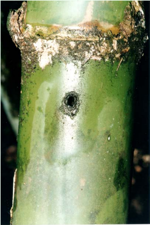
Figure 5. Internodes of Guadua chacoensis (Rojas) Londoño and Peterson (Poaceae) with a hole in the wall. High quality figures are available online.