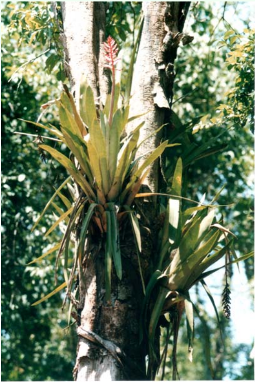
Figure 7. Aechmea distichantha Lemaire (Bromeliaceae) at the field site in Iguazú National Park, Misiones Province. High quality figures are available online.