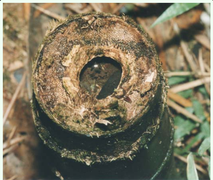
Figure 6. Stumps of Guadua chacoensis (Rojas) Londoño and Peterson (Poaceae). High quality figures are available online.