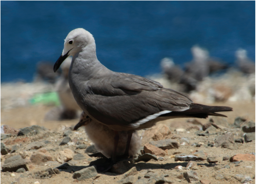
Figure 2. Adult Gray Gull shading a chick at the coastal colony of Playa Brava, northern Chile.

The Playa Grande colony was inspected on 6 January 2015 and included 40 nests: 93% contained only eggs, 3% contained