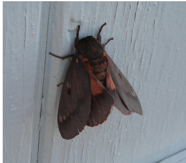
FIG. 1. Citheronia sepulcralis found on February 21, 2009, Grand Bahama Island, Bahamas.

Apparently the distribution of C. sepulcralis does not merely follow the distribution of pine, but more