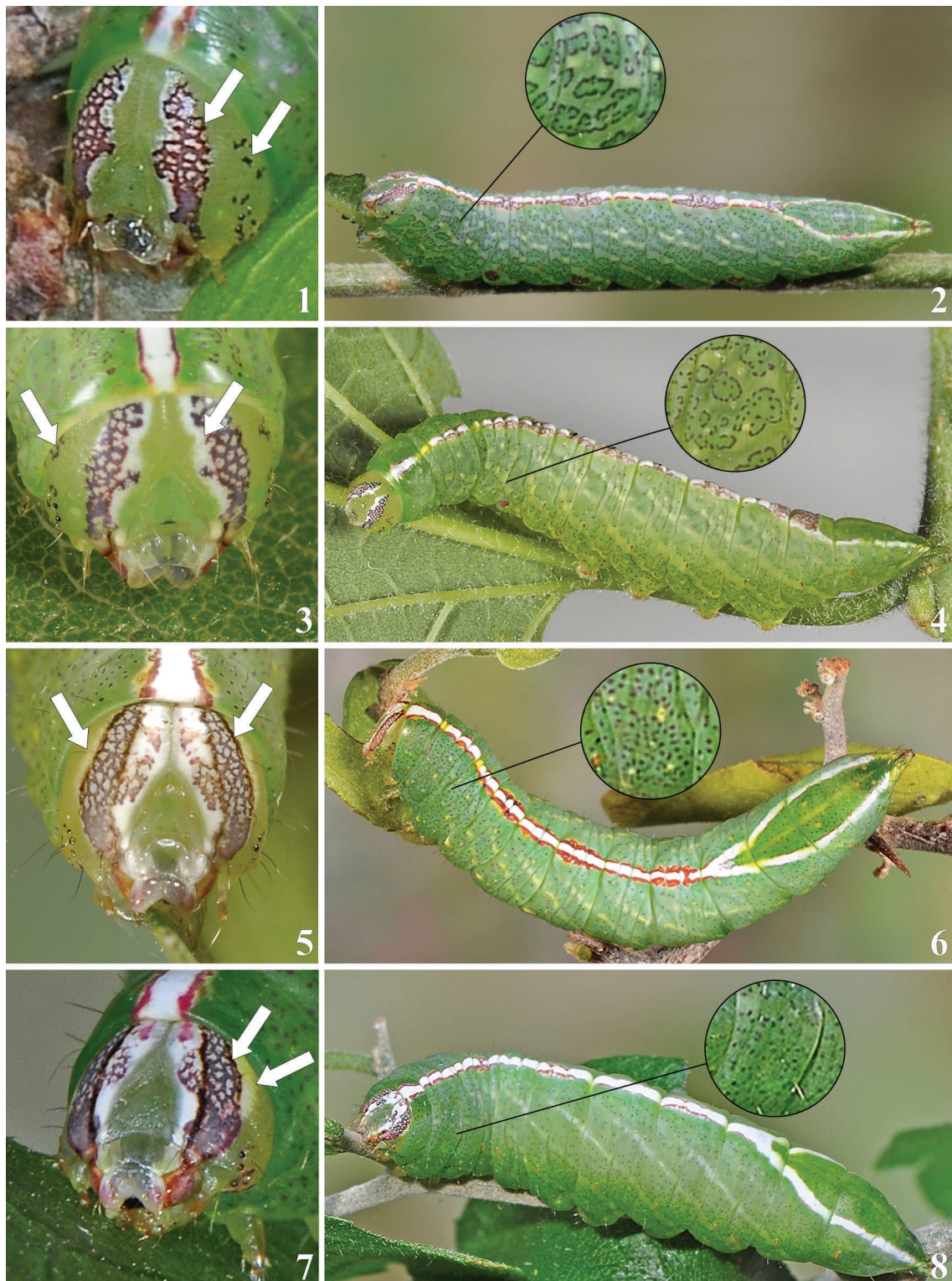
FIGS. 1–8. Visual key to fifth instar Rifargia . 1. R. subrotata head, unlined vertical band and spotted gena emphasized; 2. R. subrotata dorsolateral, inset: blue spots form irregular circles; 3. R. n. sp. head, spotted gena and generous white edging emphasized; 4. R. n. sp. dorsolateral, inset: blue spots form irregular circles (inset from different individual); 5. R. ditta head, elongate creamy spot and edging of red band emphasized; 6. R. ditta dorsolateral, inset: simple blue spots; 7. R. benitensis head, edging of red band and elongate creamy spot highlighted; 8. R. benitensis dorsolateral, inset: simple blue spots.