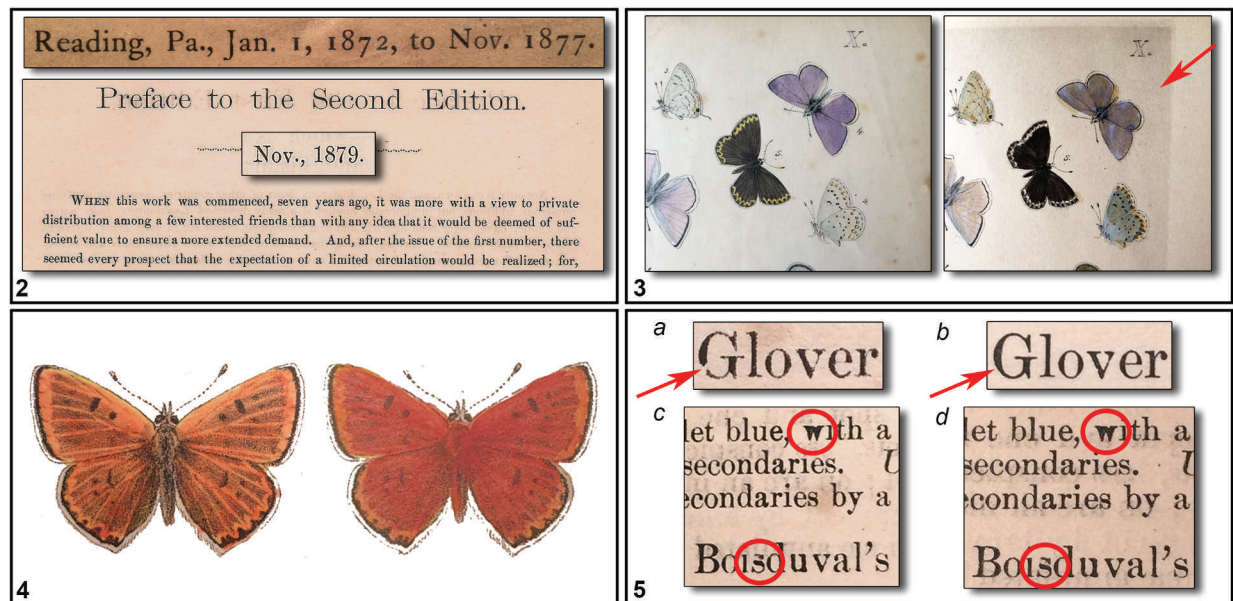
FIGS. 2–5. Features of the first and second editions of Rhopaloceres and Heteroceres . 2. Publication date from the wrapper of the second edition (top), and portion of the preface for same edition. Inset is the date given in the preface. 3. Detail of Plate 10 from the first (left) and second editions. Note gray background on the plate for the second edition (red arrow) and poor quality coloring of the figures. 4. Dorsal figure of male Lycaena rubidus sirius (W. H. Edwards) from Pl. 10 of the first (left) and second editions. This figure is likely based on an existing specimen from Strecker's collection (FMNH), labeled "c" from Colorado. 5. Comparison of letterpress between the first and second editions: a , imperfect "G" from pg. 5 of first edition; b , corrected "G" from same page in the second edition; c , d , defective "w" and imperfect "s" from pg. 89 of both editions.

Books and Apparatus in connection with Natural History."