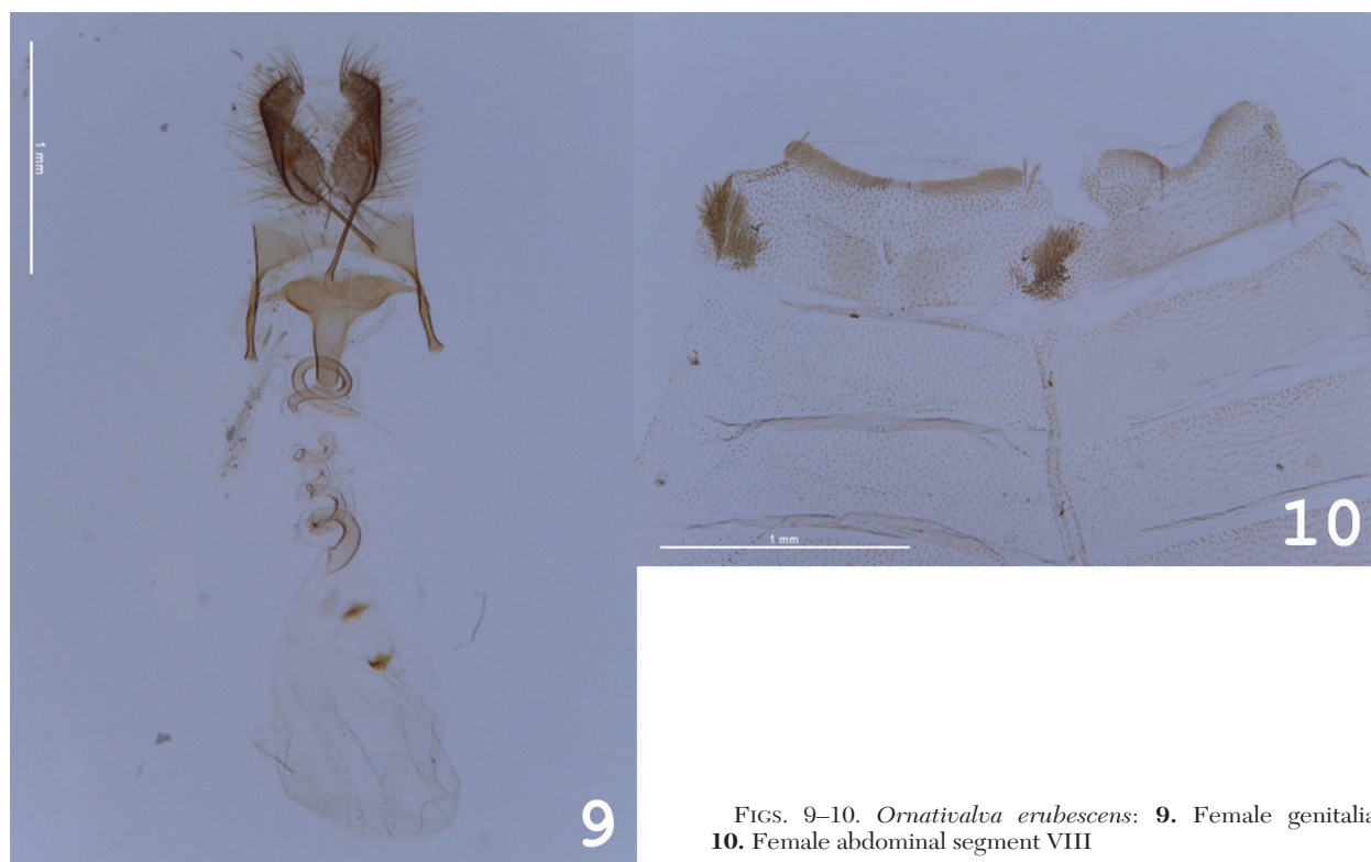
FIGS. 9–10. Ornaturalva erubescens : 9 . Female genitalia; 10 . Female abdominal segment VIII

for examining specimens and slide mounts. Images were made with the Passport II Imaging System with a Canon MPE 65 mm 1–5X micro-photography lens, and with a Leica stereoscope with Leica Application Suite 4.6©. Specimens are deposited in the Arizona State University Hasbrouck Insect Collection (ASUHC), at least one male and one female deposited in the U.S. National Museum of Natural History (USNM), and several specimens in the British Museum Natural History, London (BMNH) (Ian Watkinson, personal communication, June 26, 2017).