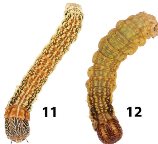
FIGS. 11, 12. Comparison of North American Lacosoma species. 11. L. arizonicum , freshly molted final instar, captive reared ex. wild collected southern Arizona, USA. 12. L. chiridota , mature final instar, captive reared ex. female Austin Cary Forest, Alachua County, Florida, USA. Not to scale.

Parasitoid: Of the eight L. arizonicum larvae originally collected by RAS, five perished, two resulted in either an eclosed adult or a (presently, at time of writing) diapausing larva, and one penultimate instar produced a single tachinid parasitoid that pupated after