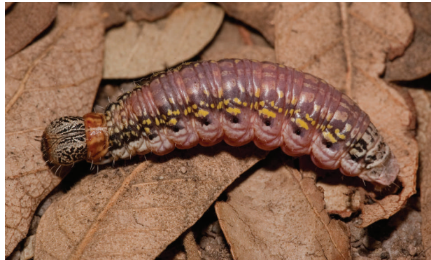
FIG. 10. Prepupal Lacosoma arizonicum larva, USA, AZ, Cochise County, Huachuca Mountains, Miller Canyon, 5.X.2012, 4 cm in length. (Photo courtesy of Charles W. Melton, used with permission).

We have not observed prepupal larvae directly because the larvae that survived to this stage remained within their larval shelters up until and during the pupal stage. However, Charles W. Melton provided photos (one shown in Fig. 10) of what we deduce to be a prepupal larva. This inference is based on the darker than usual coloration, wandering behavior as evident by the observed behavior of this individual being found crawling on the ground in an oak woodland, and the late season record: 5.X.2012 (C. Melton pers. comm.). The photo shows a larva similar to the one that we figure in Fig. 6, but more purple in coloration and fully fed. The purple hue is most obvious on the abdominal segments except A8–A10. Considering that this apparently prepupal larva was found in the absence of its larval shelter, we recognize the possibility that L. arizonicum