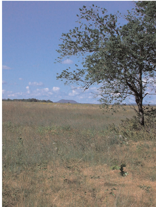
FIG. 2. Sandplain grassland habitat of Grammia phyllira at Westover Air Reserve Base in Chicopee, Hampden County, Massachusetts, U.S.A. The habitat consists of the perimeter of an active airfield that is maintained by mowing in the late summer or early autumn on an annual or biennial basis. The dry, sandy soils favor drought-tolerant grasses and forbs. Photographed on 8 August 2002, from the southeast side of the airfield, looking north.

For the captive breeding attempts, each virgin female was paired with a single male in a gallon-size glass jar covered with polyester netting, with paper towel on the bottom and a few dry little bluestem stalks for perching. Each morning the interior of each jar was misted. Caterpillars were divided into separate lots shortly after hatching, kept in plastic vials, and initially fed either plantain or organic Romaine lettuce. Some larvae were given to D.L. Wagner and B.D. Williams to help with rearing, and excess larvae were either released or euthanized. In later instars, larvae were fed either honeysuckle or organic Romaine lettuce. As with the progeny of the wild-collected females, larvae were divided into smaller lots as they grew, each lot in a plastic tray covered with polyester netting. Dry Sphagnum moss was added to each tray to absorb moisture and to serve as a pupation medium. Captive-bred larvae were reared in an artificial indoor rearing environment in order to force continuous development. Temperature was kept between 24 and 26 °C, and containers were lit with eight 40-Watt “daylight” (5000 K) fluorescent tubes