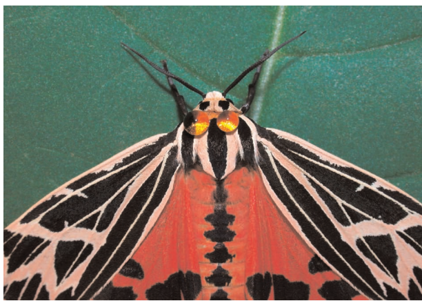
FIG. 20. Adult ♀ Grammia phyllira , molested to elicit a “flash” display of the hind wings and subsequent release of a presumably repellent, transparent yellow fluid from the cervical glands on the prothorax. First generation progeny of the wild female taken in 2002 (Fig. 4) at Westover Air Reserve Base in Chicopee, Hampden Co., Massachusetts, U.S.A. Photographed on 17 August 2002.

The genetic hypothesis that the phyllira and oithona phenotypes result from a single autosomal gene with two alleles, a phyllira allele with incomplete dominance and a recessive oithona allele, is the simplest, most parsimonious hypothesis consistent with the data presented in this paper. However, there are many alternative, more complex hypotheses that may result in the results presented here, including the possibility of more than two alleles, or epistatic interactions between multiple genes. Although additional complex, long-term breeding experiments could be performed, the genetic mechanisms underlying wing pattern phenotype in G. phyllira could be more directly elucidated using modern molecular techniques.