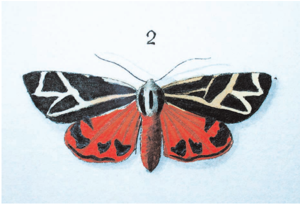
FIG. 1. Illustration accompanying the original description of Grammia phyllira , reproduced from Drury (1770–[1782]), Vol. 1, Pl. 7, Fig. 2 (Ernst Mayr Library, Museum of Comparative Zoology, Harvard University). Note that the illustration is asymmetrical, with no medial transverse band on the left forewing and a complete medial transverse band on the right forewing, indicating the variation in this character. The right forewing also shows a trace of the primary longitudinal pattern, as found in form conspicua (Stretch, 1906).

× ♂ oithona ; and cross 2003–08, ♀ oithona × ♂ oithona . Between 12 and 18 October 2003, second generation progeny of the second wild female were paired for breeding: cross 2003–09, ♀ phyllira × ♂ phyllira (both from cross 2003–01); cross 2003–10, ♀ oithona × ♂ oithona (both from cross 2003–03); cross 2003–11, ♀ phyllira × ♂ phyllira (both from cross 2003–05); cross 2003–12, ♀ oithona × ♂ phyllira (both from cross 2003–05); cross 2003–13, ♀ phyllira × ♂ phyllira (both from cross 2003–01); cross 2003–14, ♀ phyllira × ♂ phyllira (both from cross 2003–05); and cross 2003–15, ♀ oithona × ♂ phyllira (both from cross 2003–05).