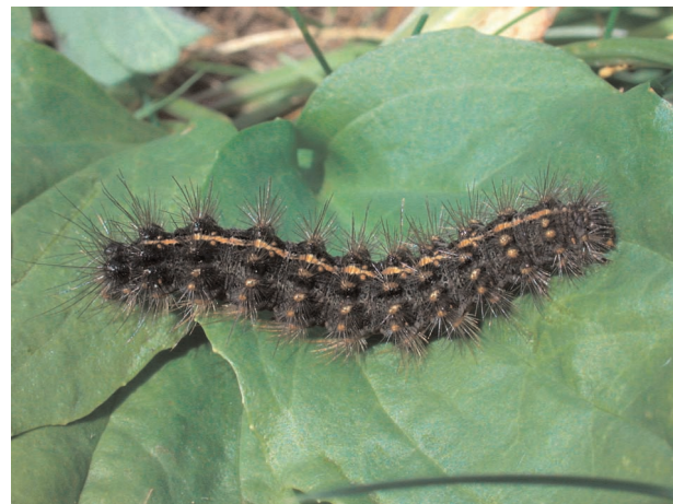
FIG. 3. Final instar larva of Grammia phyllira , first generation progeny of the wild female taken in 2002 (Fig. 4) at Westover Air Reserve Base in Chicopee, Hampden Co., Massachusetts, U.S.A. Photographed on 25 July 2002.