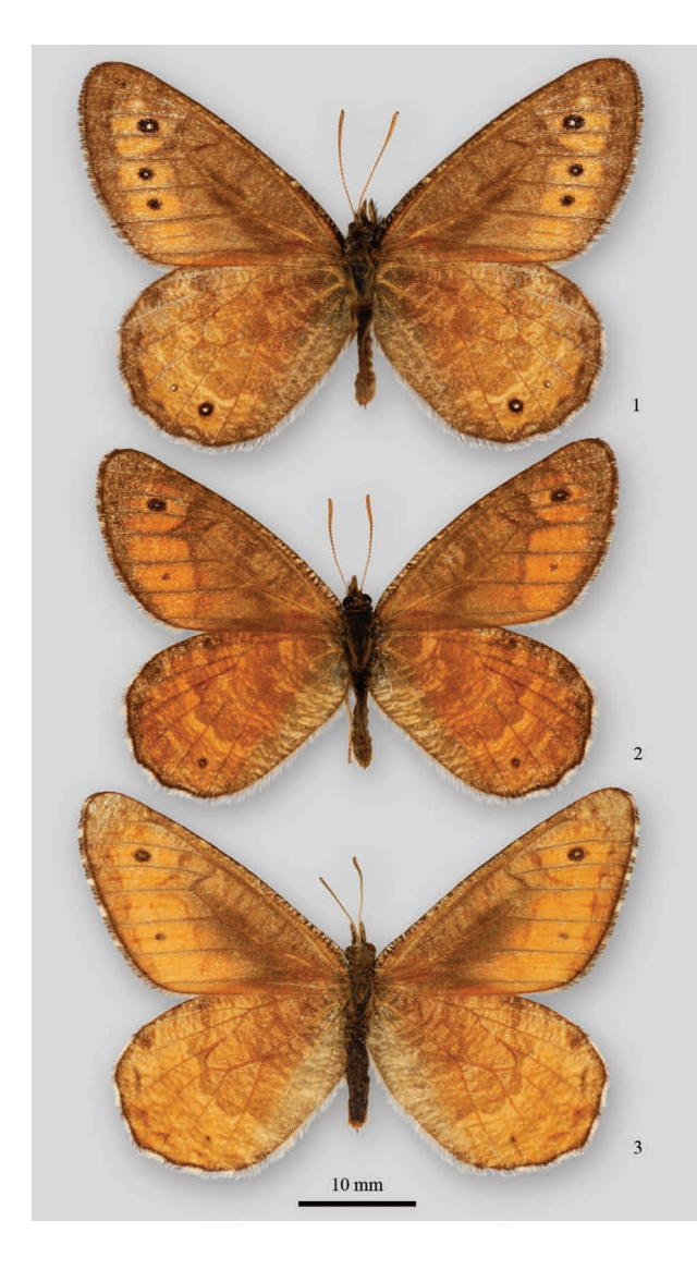
FIGS. 1-3. 1. Prototype of Grade 3 dark scaling along forewing medial and cubital veins, essentially causing the limbal region to appear to be banded by a row of rounded spots. The hindwing evespot in this individual is developed to Grade 3 also, with a white pupil present, as is that in cell \dot{M}_1 . The DFW spots in cells M<sub>3</sub> and Cu<sub>1</sub> are developed to Grade 2, or subjectively to Grade 2 1/2. 2. Prototype of Grade 2 dark scaling along forewing medial and cubital veins, with only the scaling along M<sub>3</sub> extensive enough to cause the light spot in cells M<sub>2</sub> and M<sub>3</sub> to appear to have rounded corners. The forewing M, evespot is typical of Grade 2, with size not reduced, but pupil unexpressed. The Cu<sub>1</sub> spot is Grade 1 or 1/2. 3. Prototype of Grade 1 dark scaling along the forewing medial and cubital veins, with scaling limited to the veins themselves and not spreading into the adjacent cells. The forewing Cu1 spot of this and the middle specimen are typical of grade 1 development, with size reduced and white pupil absent. This specimen also has a Grade 1 hindwing eyespot. The occasional eyespot which is reduced in size, but still clearly pupiled is classified as grade 3. The bottom specimen is typical of the Socorro County isolate; dark limbal scaling is reduced as is the DHW eyespot.

Thus, my intent here is not to break new ground in evolution, taxonomy or ecology, but to leave a written record of what I saw after it can no longer be seen. To do this, I merely need find a trait which is unique to the Socorro Co. isolate. In this paper, I shall do no less and no more than this. As I have done before, I shall buttress my arguments for the distinctiveness of this new subspecies by statistical factors, so that observation of a single insect may be inadequate to skewer it with a subspecific identity (Holland 1988, 1995).