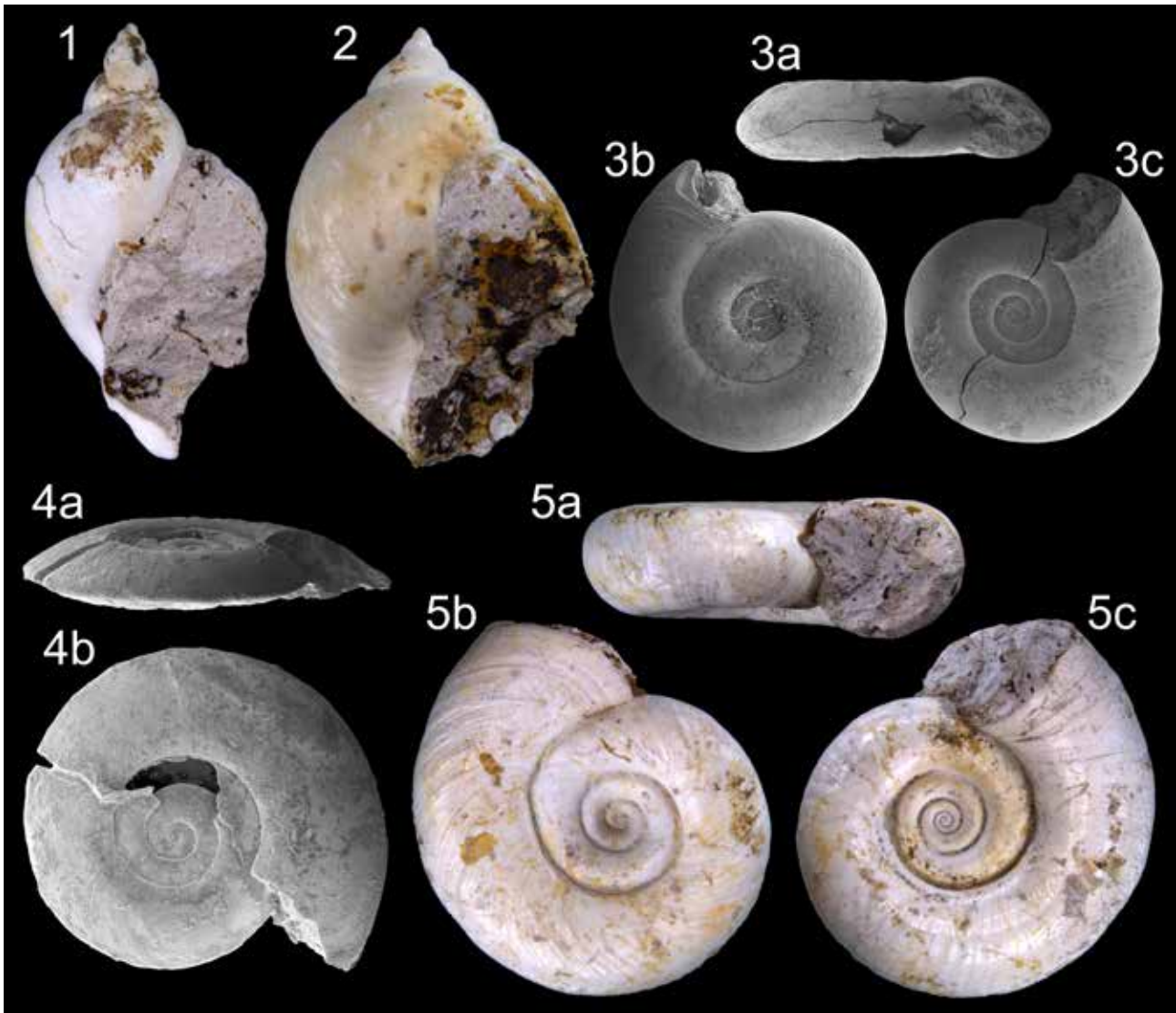
Fig. 2. Fossil freshwater gastropods from Hohenmemmingen. 1. Lymnaea dilatata , SMNS 107257 (H = 12.7 mm, D = 6.5 mm). 2. Radix socialis , SMNS 107235 (H = 19.1 mm, D = 13.0 mm). 3a. Gyraulus applanatus , SMNS 107330/1 (H = 1.1 mm, D = 4.3 mm). 3b. Gyraulus applanatus , SMNS 107330/2 (D = 4.1 mm). 3c. Gyraulus applanatus , SMNS 107330/3 (D = 3.9 mm). 4a. Hippeutis subfontanus , SMNS 107331/1 (H = 0.7 mm, D = 3.4 mm). 4b. Hippeutis subfontanus , SMNS 107331/2 (D = 2.6 mm). 5a–c. Planorbarius mantelli , SMNS 107335 (H = 8.1 mm, D = 22.6 mm).

Gyraulus species display a large amount of morphological variation, with the extremes described as distinct species, but with numerous intermediate forms; this phenomenon has also been observed in conspecifics from other OBM and OSM localities (e.g., KOWALKE & REICHENBARCHER 2005; SALVADOR & RASSER 2014; SALVADOR et al. 2016b). As a result, Gyraulus dealbatus is considered a synonym of G. applanatus (KOWALKE & REICHENBARCHER 2005; SALVADOR et al. 2016b); the status of G. kleini still remains uncertain, but it agrees with intermediate forms in the spectrum of morphological variation seen in G. applanatus .