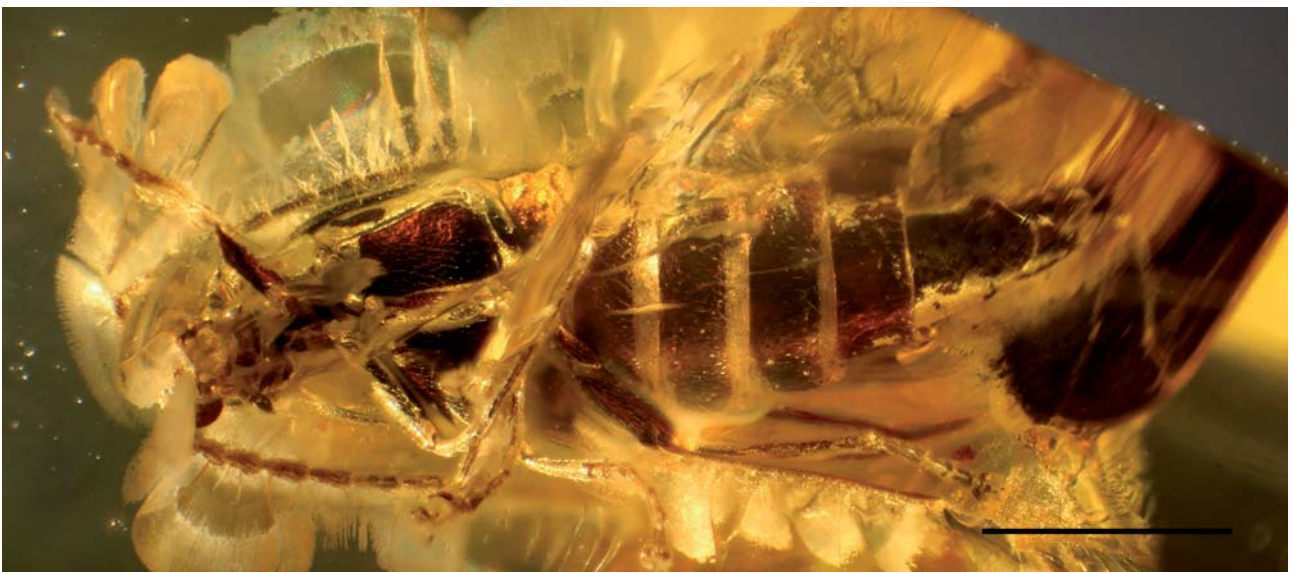
Fig. 2. Mantimalthinus balticus gen. et sp. nov., Baltic amber. Holotype, ventral view. Bar = 1.0 mm.

H o l o t y p e : Probably male, specimen included in Baltic amber, ARTUR R. MICHALSKI leg. , deposited at the Museo Civico