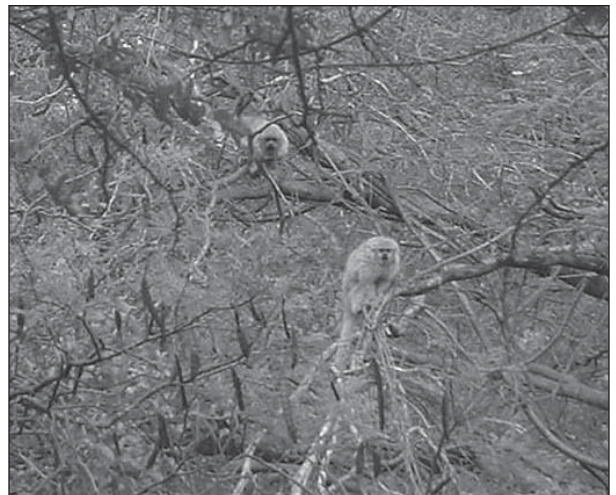
Figure 2. C. pallescens at Ravelo (#1), Martin Thurley.

camp Tucavaca and nearby points (#6, 7, 8), and community sites along the Parapetí river (#13 through 19). From Ravelo and Palmar there are photos and a video that show the long and uniformly colored pale buff pelage of the individuals (Fig. 2), as well as in Sol de Mayo (Fig. 3) and Tucavaca (Fig. 4). The photograph from Paraboca in the Parapetí river (Fig. 5) shows the same light color of the individuals sighted in nearby riparian communities, including the locality # 15 where three specimens were collected in the 1980's and assigned then to C. donacophilus pallescens by Anderson (1997). Sightings and a photo from the Rio Negro in the Otuquis Pantanal (#24, Verónica Zambrana, pers. comm.) also matched C. pallescens descriptions, as well as the photos available from the nearby Paraguayan