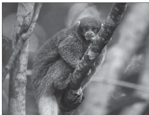
Figure 7. C. donacophilus North of Santa Cruz de La Sierra (#33), Daniel Alarcón.

C. pallescens was confirmed to occur in the subhumid ombrotype forests (>1,000 mm) of the Otuquis Pantanal of Bolivia and Paraguay, and it is the 'suspected' form – although no good images are available – that occurs in the Chiquitano forests north and northeast of Kaa Iya under sub humid and upper-dry (800-1,000 mm) ombrotypes. This area (sites # 9, 23, 25-35) has been considered partially within the range of C. pallescens (Veiga et al. , 2008a), while further north of it there would be a hiatus in Callicebus distribution since the range of C. donacophilus (#32,