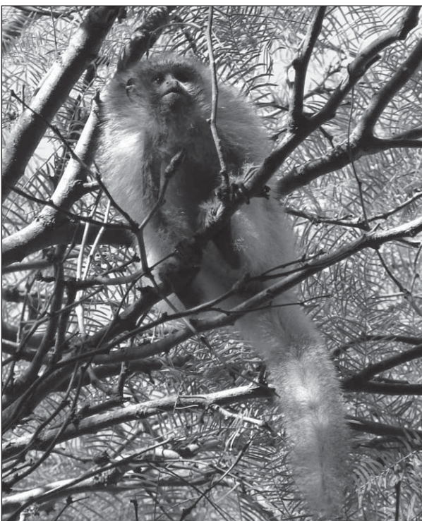
Figure 5. C. pallescens , Río Parapeti #13, Luis Acosta