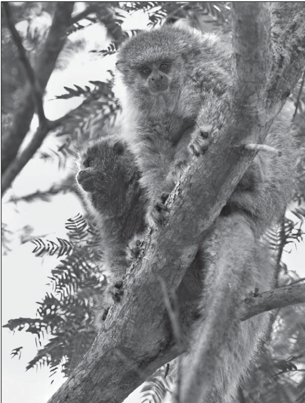
Figure 4. C. pallescens in # 7, Daniel Alarcón.

Pantanal (Smith, 2012). According to all our photos, the color pattern of C. pallescens individuals agreed with the published descriptions of the species, although their faces were not as white as in the drawing from van Roosmalen et al. (2002).