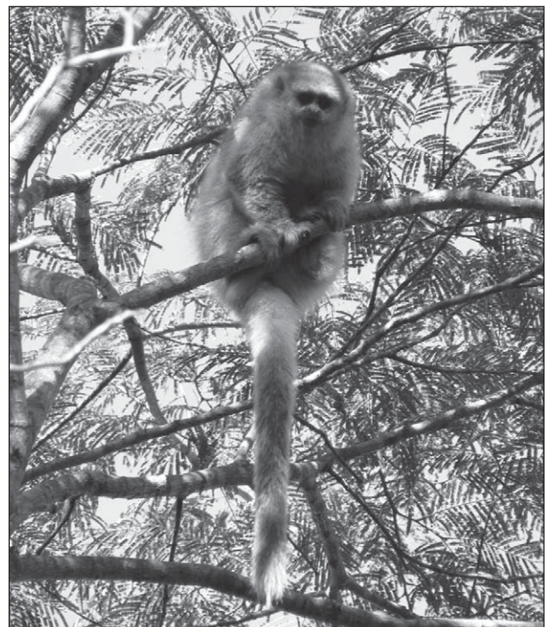
Figure 3. C. pallescens in #8, Rosario Arispe.